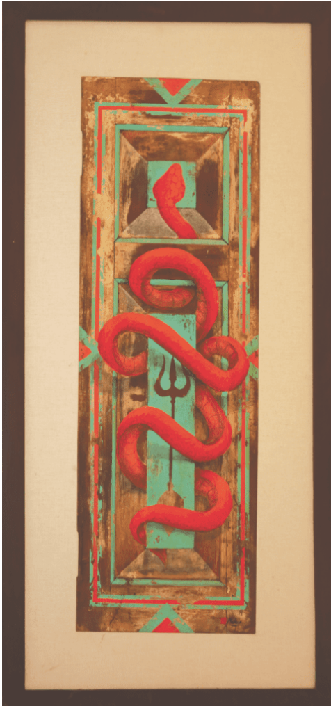
Rising energy - The Kundalini Shakti.