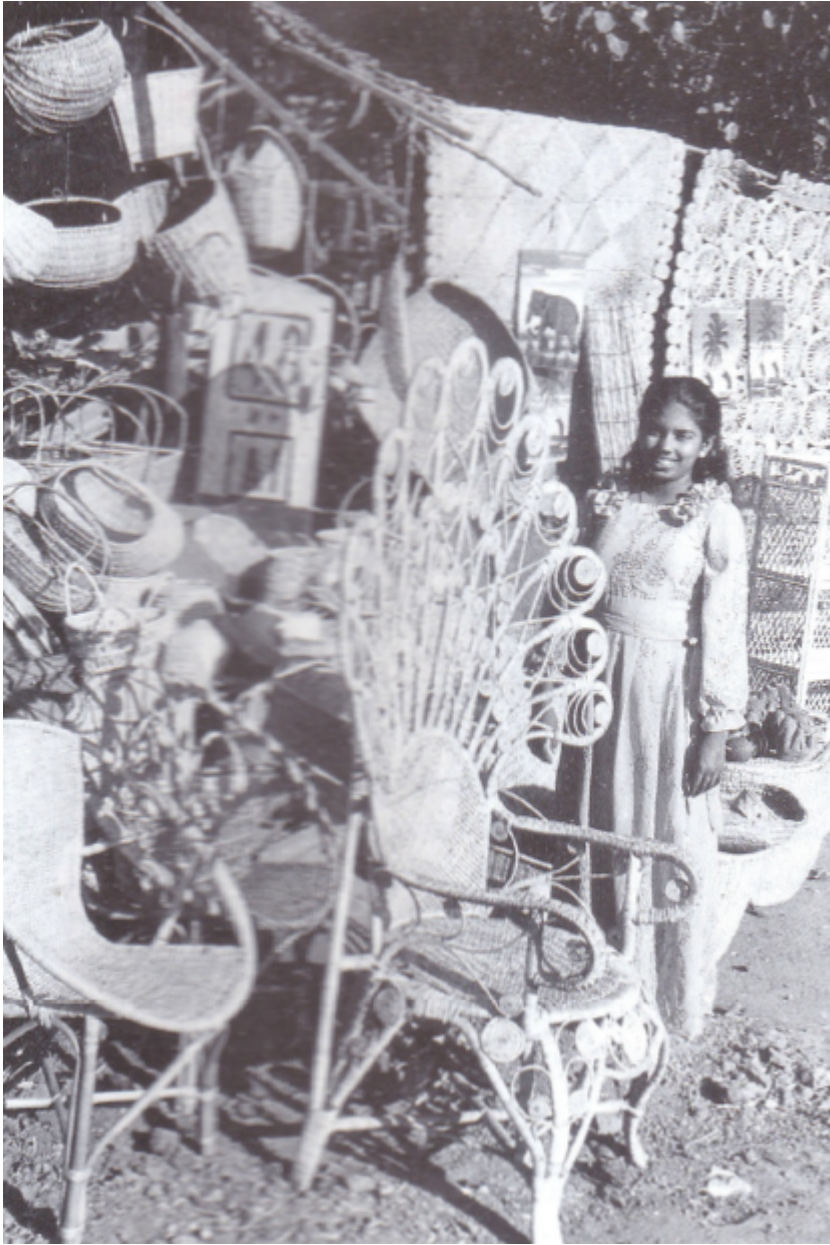
Peacock Chair - one of the many ornamental creations in Rattan on display at a wayside stall of a cane craftsman.