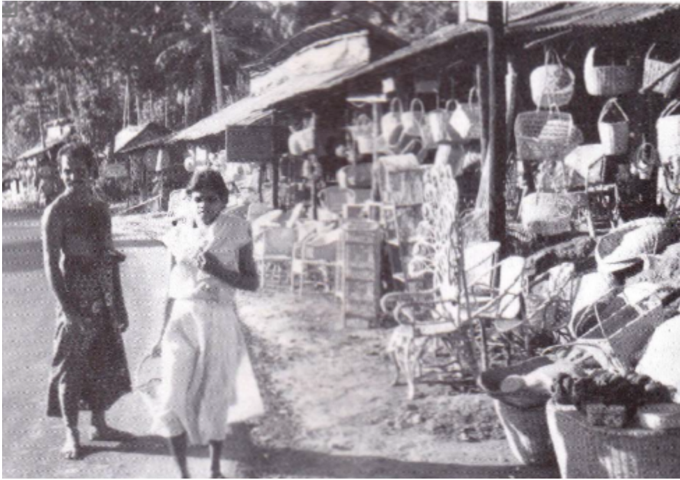
Weweldeniya on the Colombo - Kandy Road is known for its many way side stalls selling cane artefacts. The village gets its name from an old tradition of cane craftsmanship.