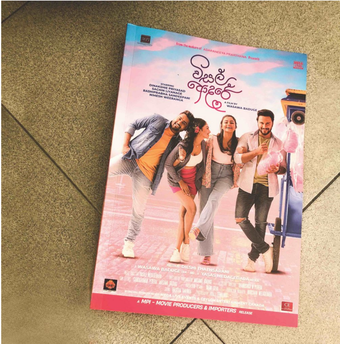
Visal Adare movie script.