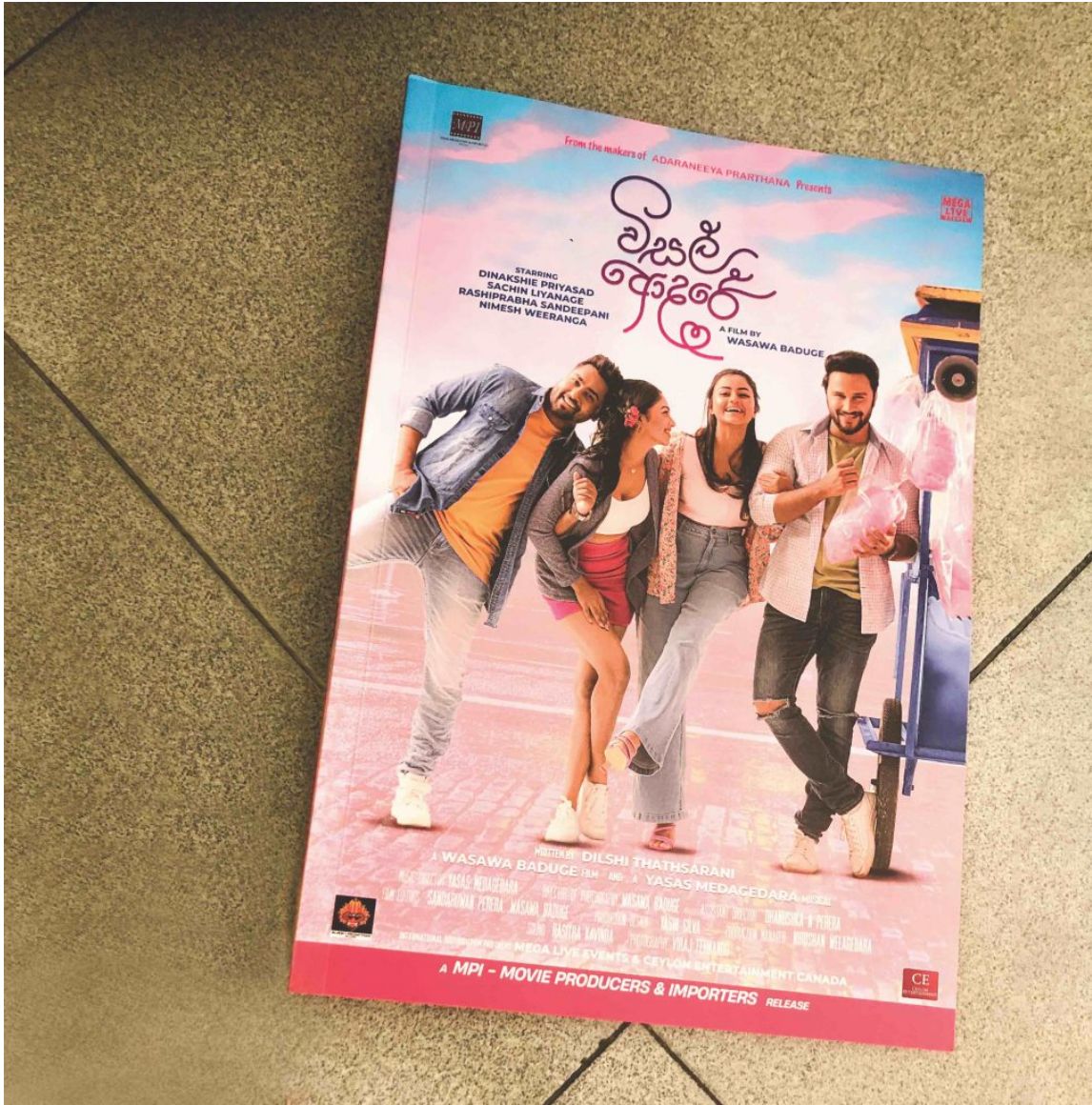
Visal Adare movie script.