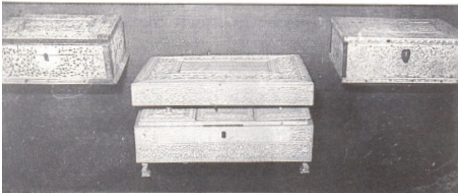
Carved boxes in ivory. (Suresh de Silva) Courtesy: National Museum.