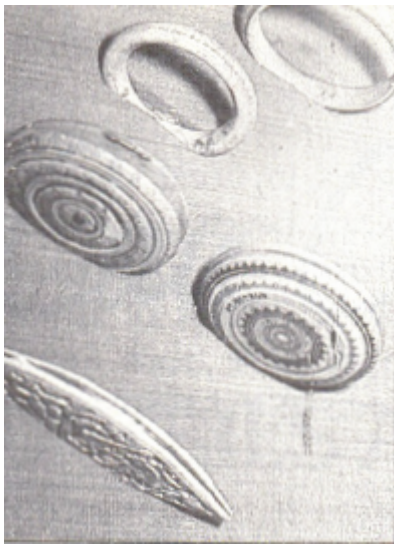
Bobbins and Bangles.

period, finely incised and dating from the 14th to 16th centuries AD. can also be seen. These were used as money and jewellery containers; also as betel boxes by the royal family and the great chieftains. The designs are representations of gods and goddesses, of the Jataka stories, of popular myths and folk-tales; designs from nature, floral emblems and the auspicious animal figures.