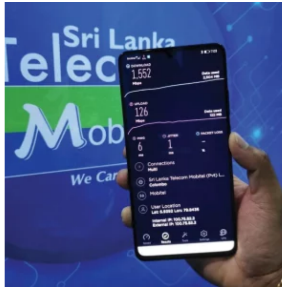
image of Mobitel 5G showcasing speeds upto 1.55Gbps.

The next generation of 5G services will not only provide Giga bit speeds, but also will revolutionize the industries across the globe with inherent ultra-reliable and low latency capabilities of 5G technology.