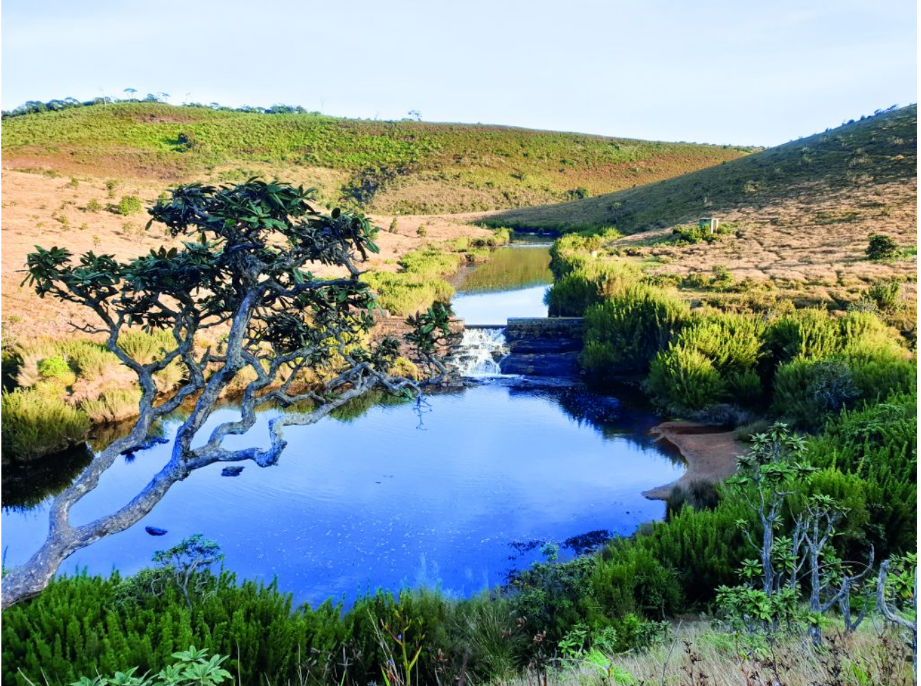
Chimney Pool at Horton Plains.

One quirk of Stage 11 is that it ends near an abandoned tea factory and a small community, meaning accommodations are limited. If you want to rest, stay a few kilometers before the trail's official end and finish the stage the next day.