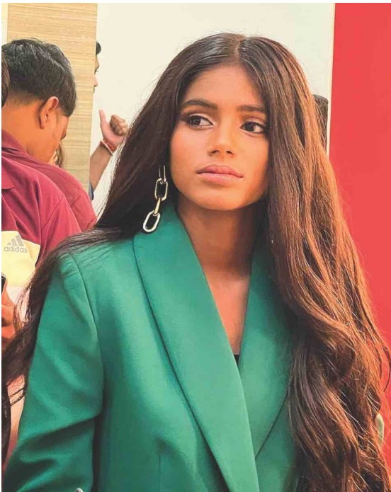
A few moments prior to appearing on India's Best Dancer Ladies Special tv show.