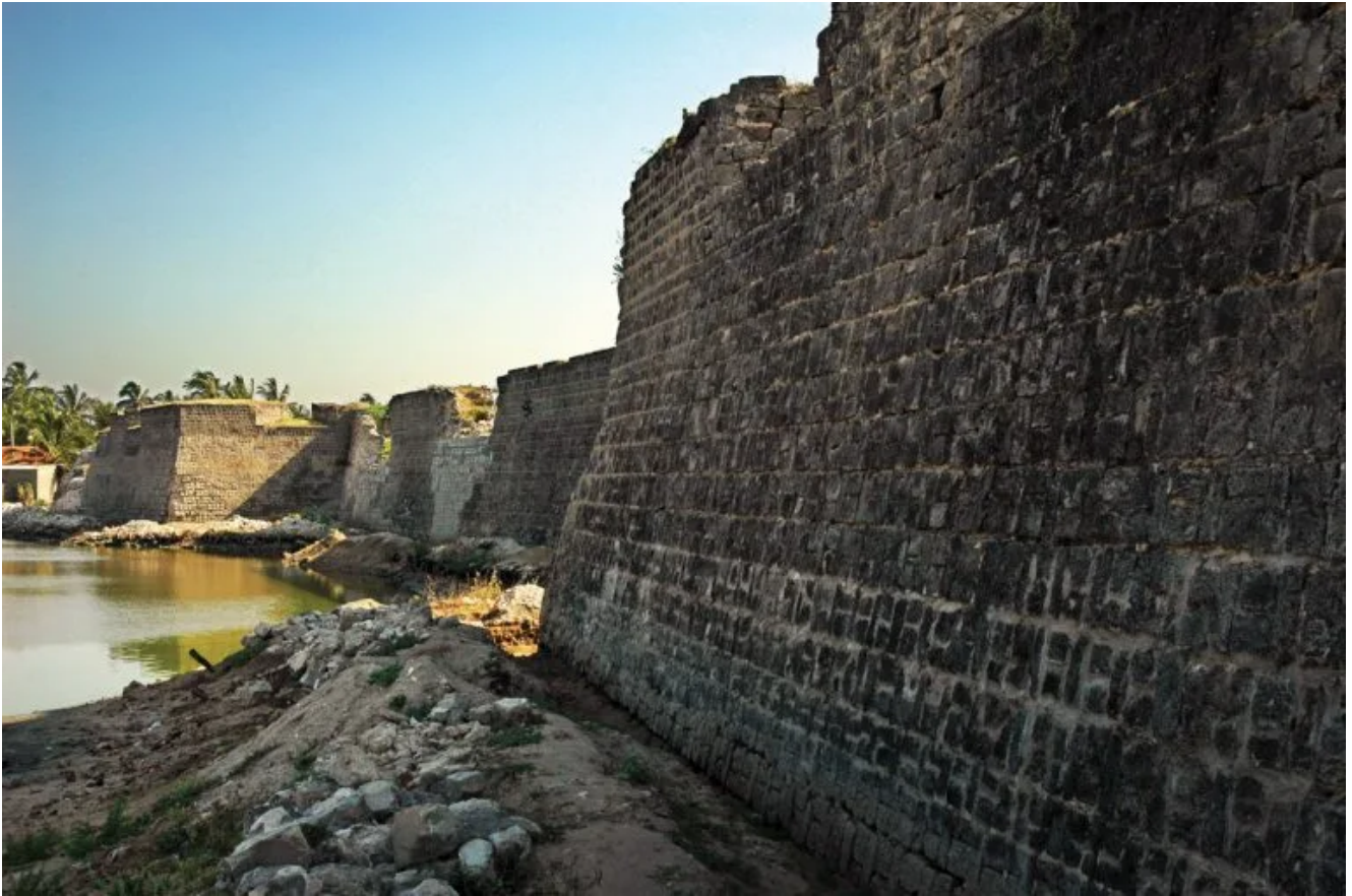
Fort of Mannar.

Jaffna town has about 90,000 inhabitants, the region (Jaffna peninsula) around 600,000 (census 2012). Almost exclusively Tamils live here (99 percent), of whom 83 percent are Hindus, while 16 percent are Christians. Before the Civil War, which began in 1983 and ended in 2009, there was a slightly larger number of Sinhalese/Buddhists and Muslims than now. Before the war, Jaffna was a prosperous town, one of the richest in Sri Lanka, and today it is in the process of rebuilding.