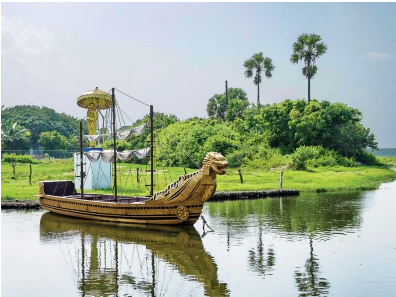
At Dambakola Patuna. A replica of the boat carrying Ven Sangamitta Theri to Sri Lanka from India.

If you continue another 65km east along the coast from Manalkadu, which we had planned to do, you come to Chundikkulam nature reserve, a famous bird sanctuary. During the bird migration season, you can see many bird species, including flamingos.