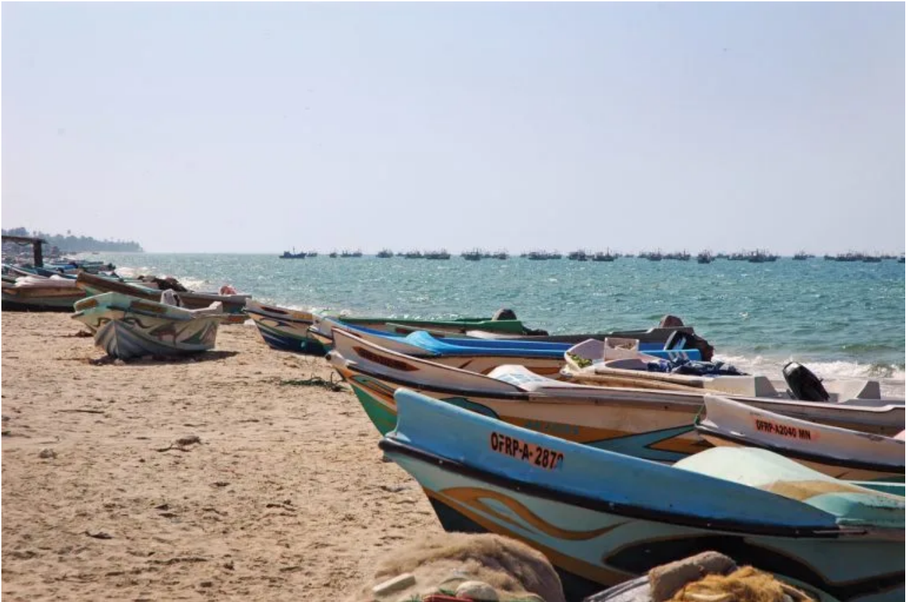
Fishing village Pesalai on Mannar Island (Photo: Anders Tunek).

In the middle of the northern coast of Mannar Island lies the fishing village of Pesalai. There are hundreds of small boats here, pulled up in the sand or anchored out in the shallow waters.