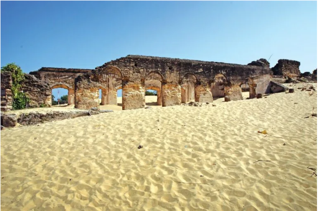
Old Dutch Church in Manalkadu.