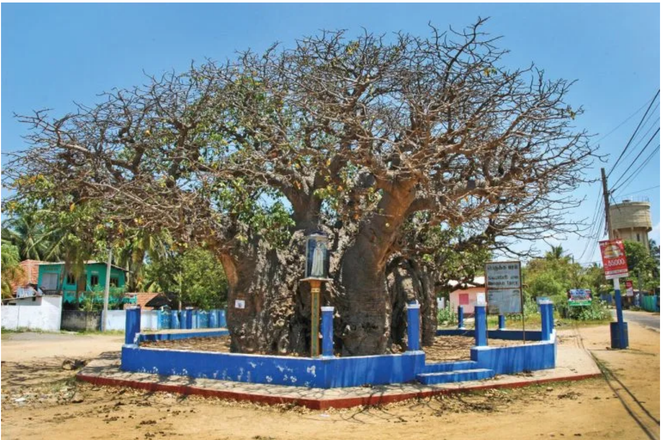
The 700-year-old Baobab tree in Mannar town (Photo: Anders Tunek).

We continued our journey to Jaffna in the northern peninsula of Sri Lanka. The distance is only 129km, the roads are good, and this part of the country is sparsely populated. The landscape is very flat, and a Swede cannot help but think about how similar it is to the landscape on the Swedish island Öland (Ölands Allvar). Not until one approaches Jaffna town do the areas become more populated.