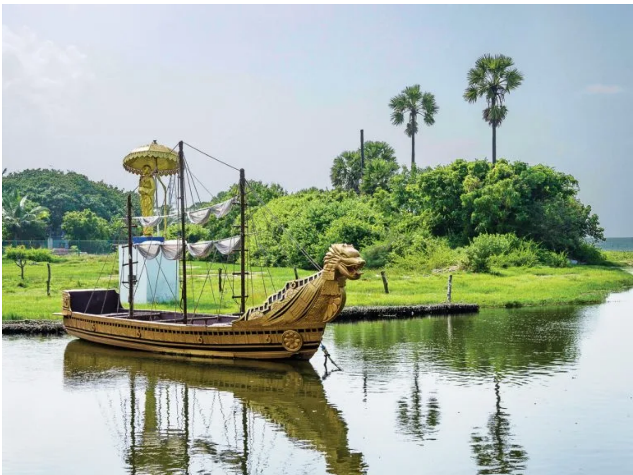
At Dambakola Patuna. A replica of the boat carrying Ven Sangamitta Theri to Sri Lanka from India.

If you continue another 65km east along the coast from Manalkadu, which we had planned to do, you come to Chundikkulam nature reserve, a famous bird sanctuary. During the bird migration season, you can see many bird species, including flamingos.