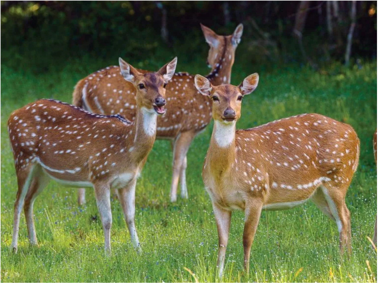
Spotted Dear (Axis Axis).