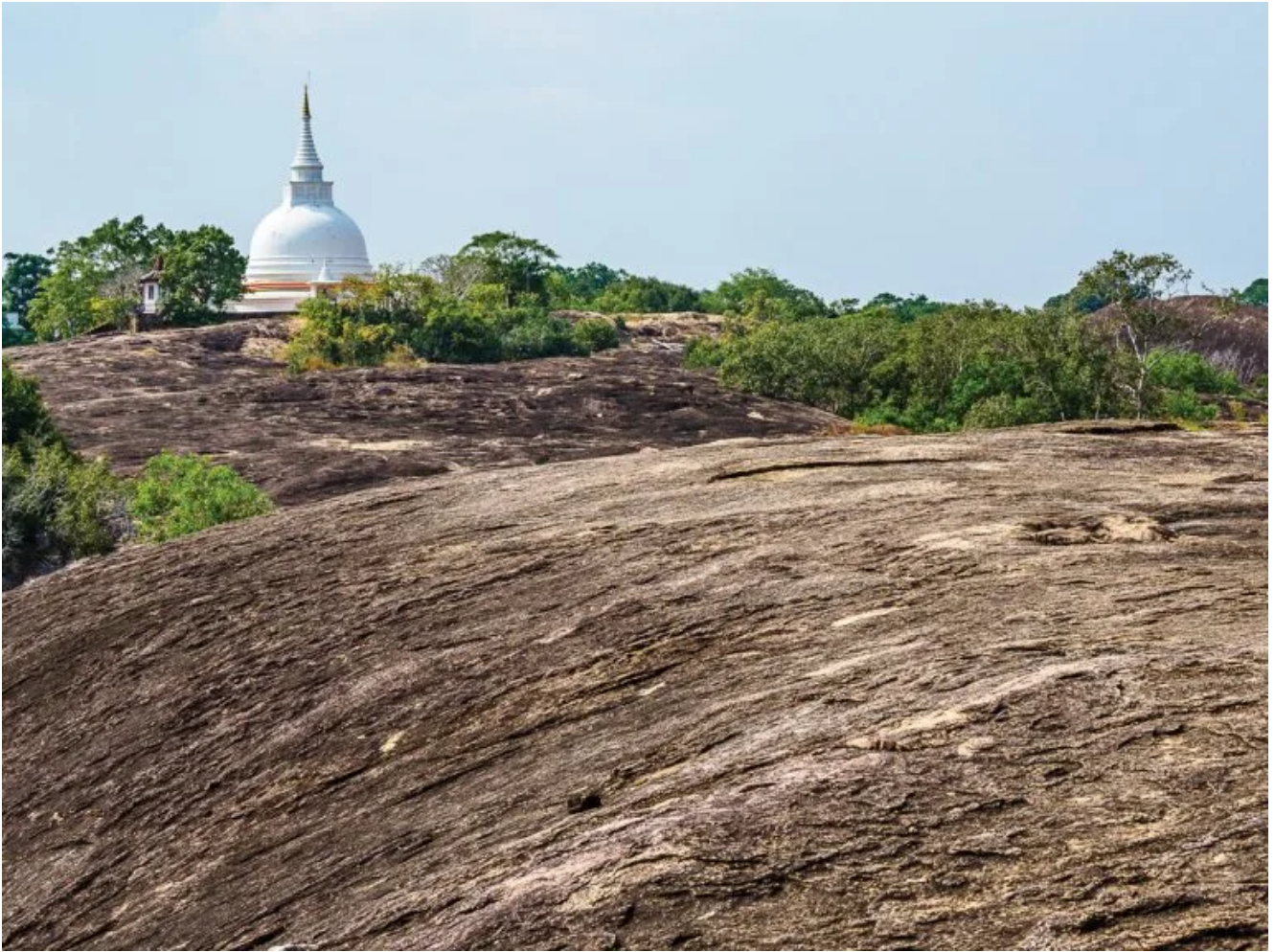
The temple at Thanthirimale, founded in the fourth century AD (Photo: Jorgen Wieslander).