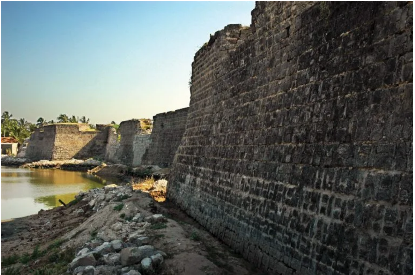
Fort of Mannar.

Jaffna town has about 90,000 inhabitants, the region (Jaffna peninsula) around 600,000 (census 2012). Almost exclusively Tamils live here (99 percent), of whom 83 percent are Hindus, while 16 percent are Christians. Before the Civil War, which began in 1983 and ended in 2009, there was a slightly larger number of Sinhalese/Buddhists and Muslims than now. Before the war, Jaffna was a prosperous town, one of the richest in Sri Lanka, and today it is in the process of rebuilding.