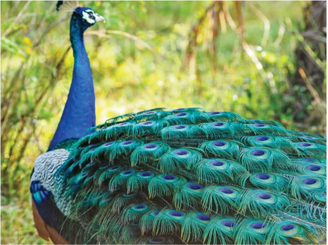
Peacock ( Pavo Cristatus ) (Photo: Jorgen Wieslander).