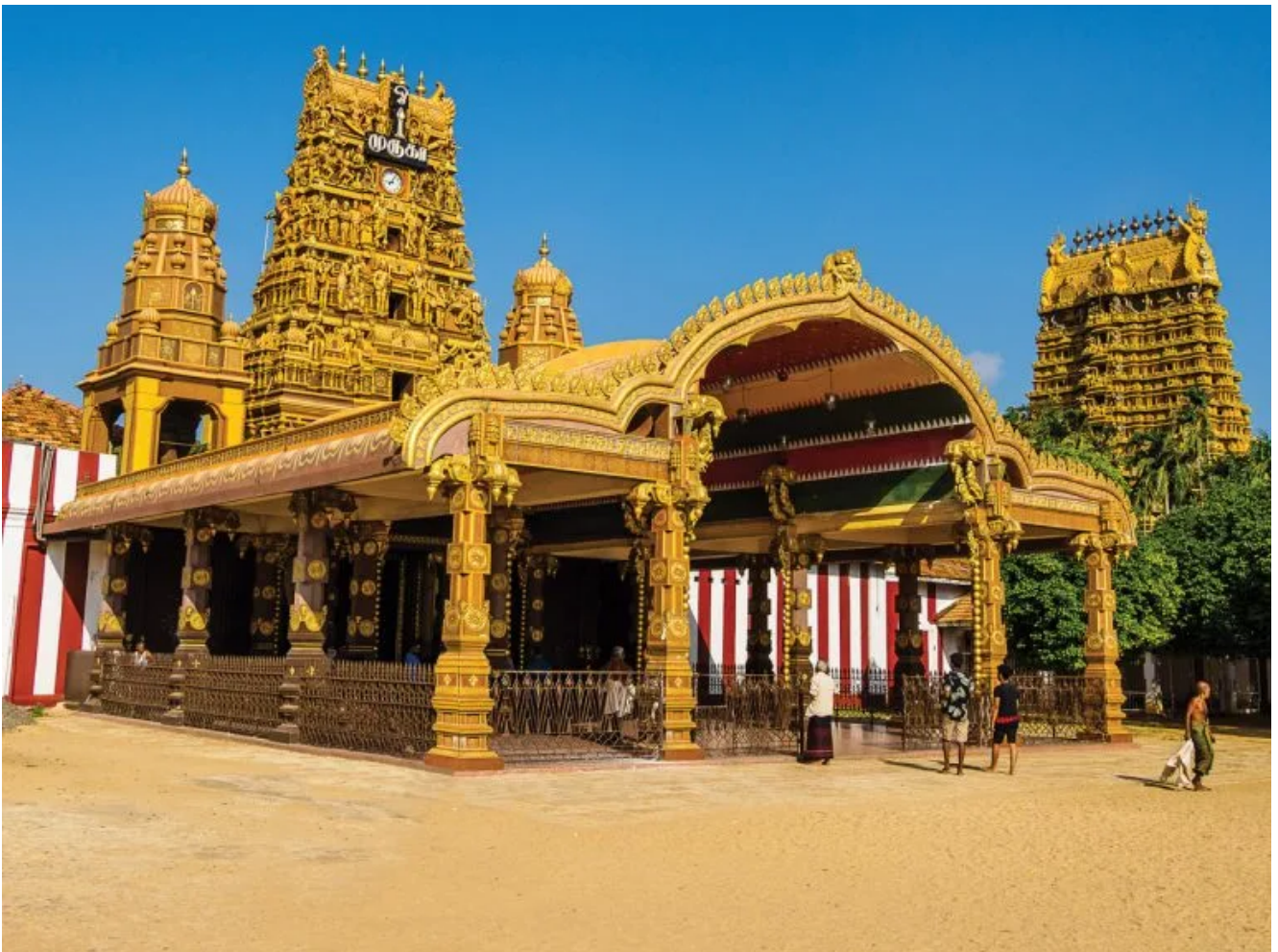
The entrance into Nallur Kandaswamy Kovil.