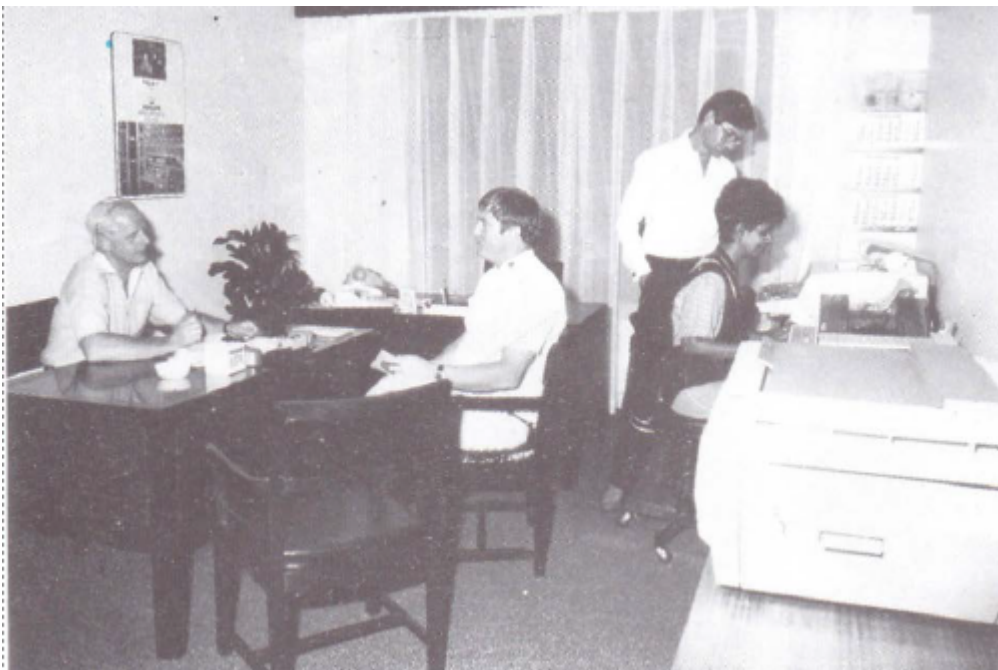
Inside the Business Centre at the Hotel Ceylon Inter-Continental, Colombo.