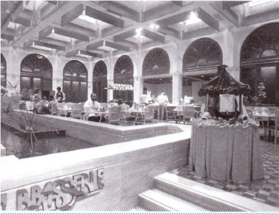
La Brasserie Coffee Shop and Restaurant at the Galadari Meridien.