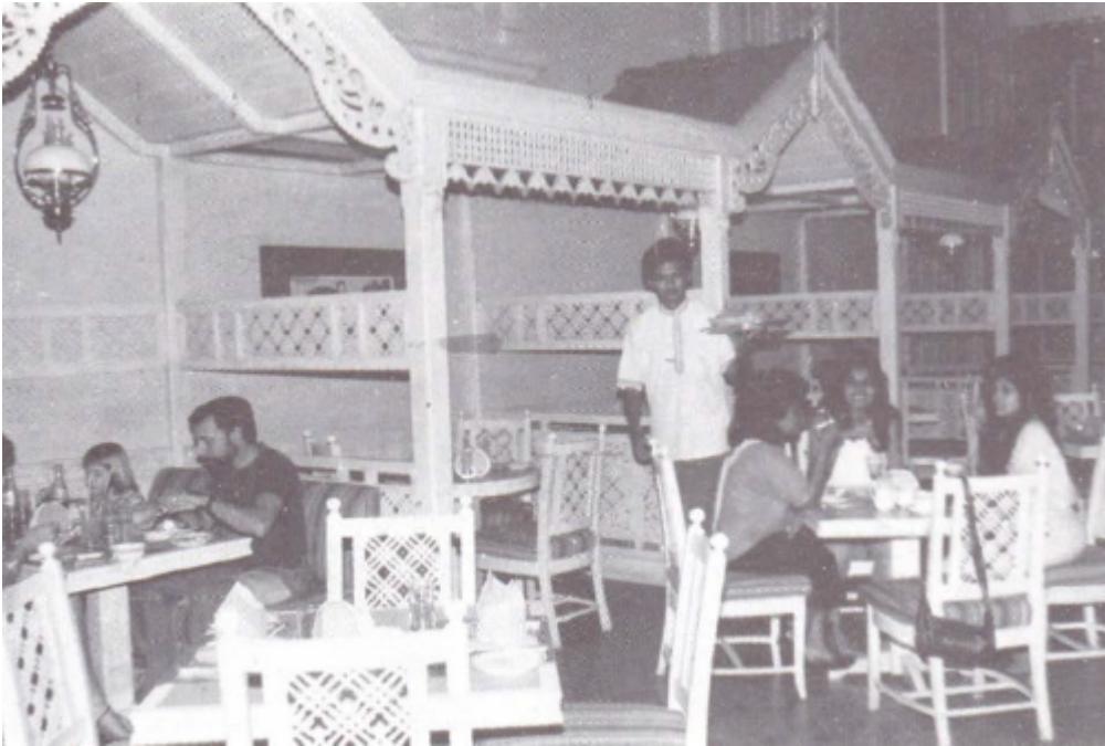
Ports of Call Restaurant at the Taj Samudra Hotel.