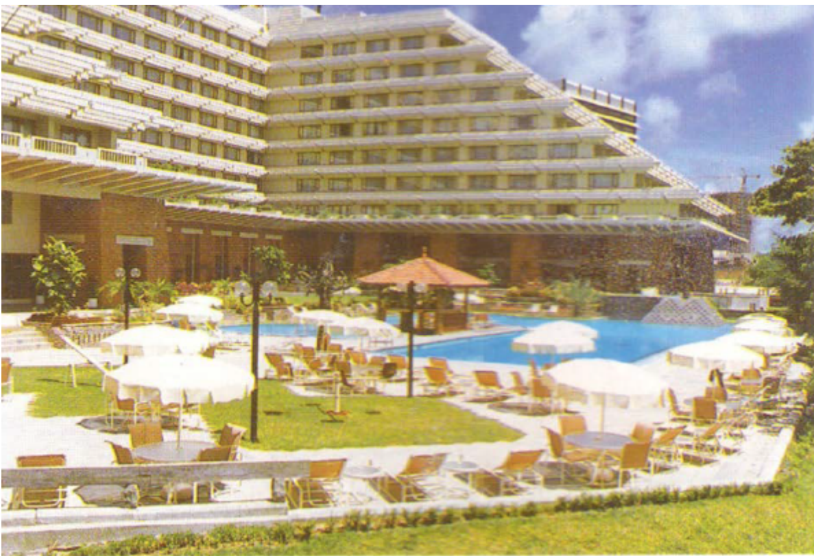
Poolside Terrace at the Ramada Renaissance, Colombo.