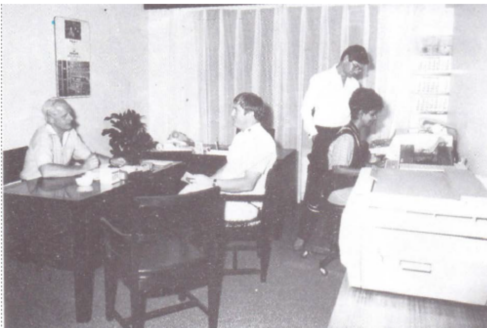
Inside the Business Centre at the Hotel Ceylon Inter-Continental, Colombo.