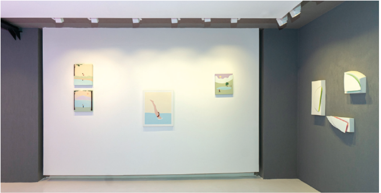
Serdar Acar's work using soft colors and simple language.