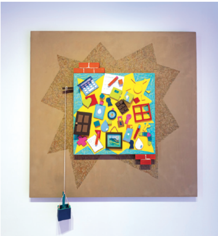
Three-dimensional wooden sculptures based on two-dimensional drawings by Ece Ağırtmış.