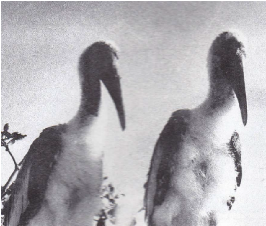
Young Painted Stork nestling.