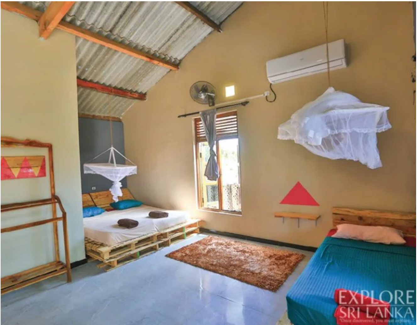
A spacious family room

Travellers can also make use of the excursions organised by The Coconut to explore the Urani Lagoon or the Kumana National Park. An opportunity to take a step back from the fast paced way of life, once a guest enters The Coconut; they are enveloped by a sense of serenity. The expansive property offers ample parking spaces.