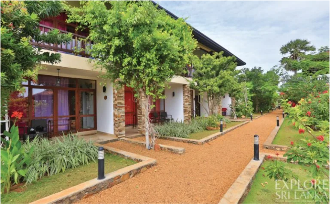
A garden paradise