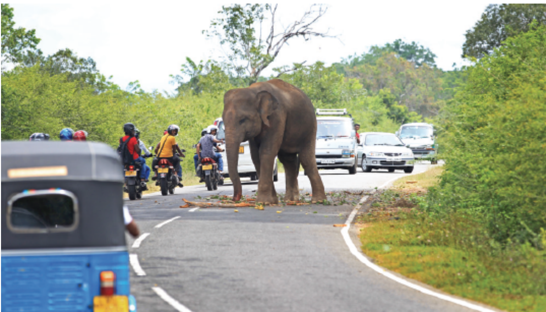
A day excursion to Buttala-Sella Kataragama Road.