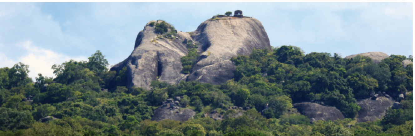
Kudumbigala rock monastery.