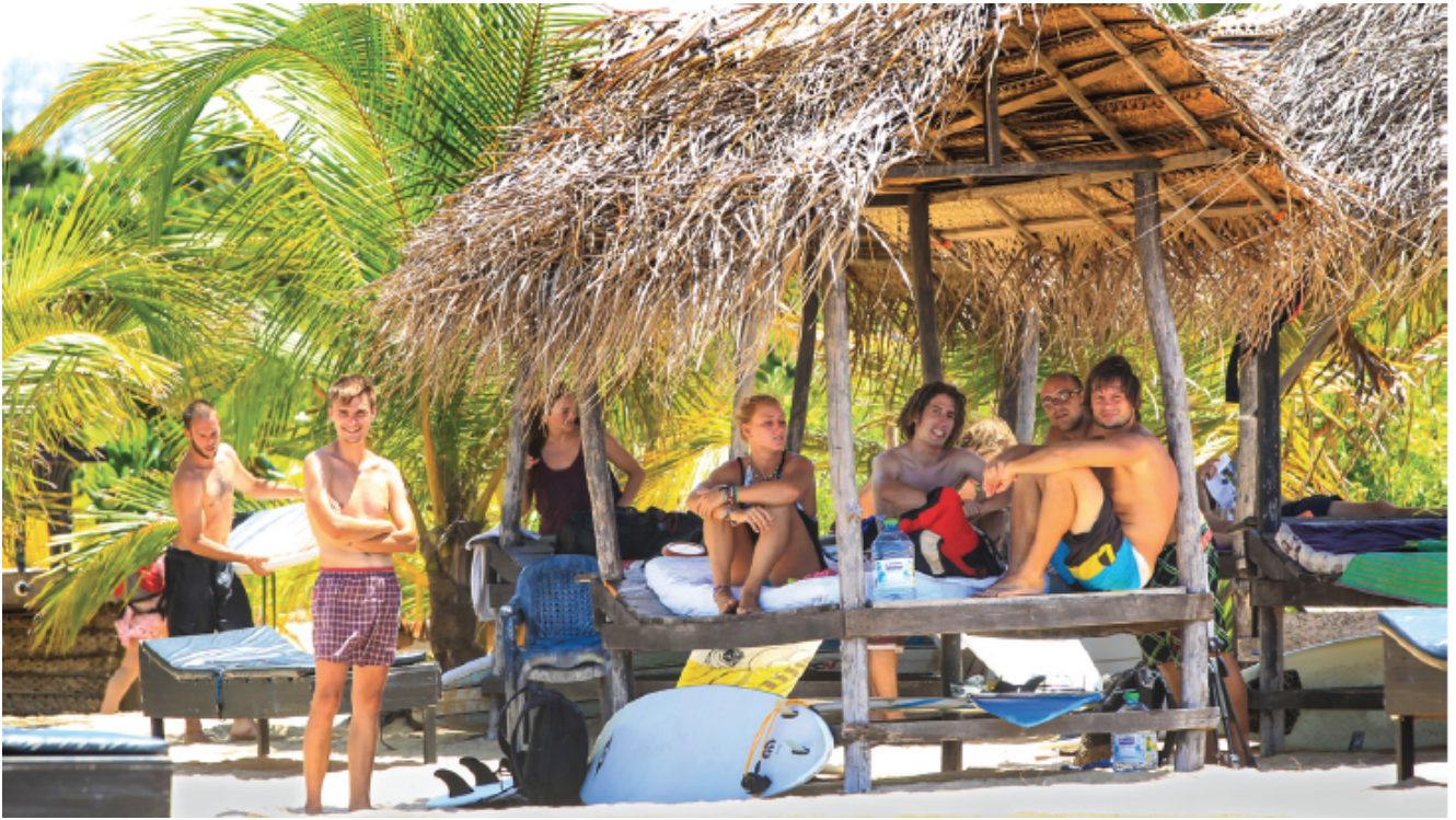
Enjoy the sun, sea and sand in Arugambay.