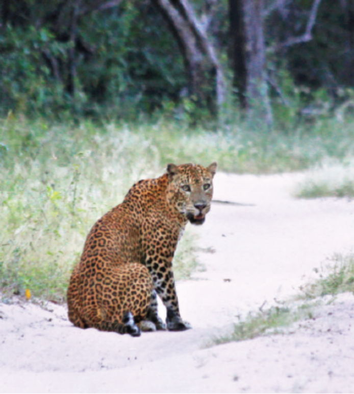
A princely leopard on alert on the main track in Kumana.