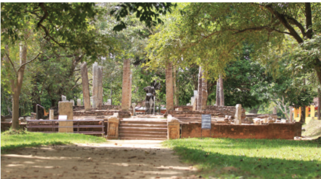
Magul Maha Viharaya, a site of a royal marriage.