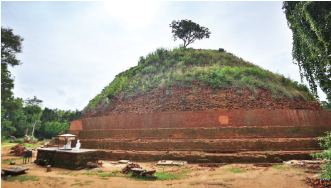
Neelagiri Stupa built by King Kavantissa.