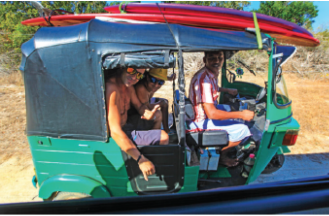
Head on a tuk tuk safari.