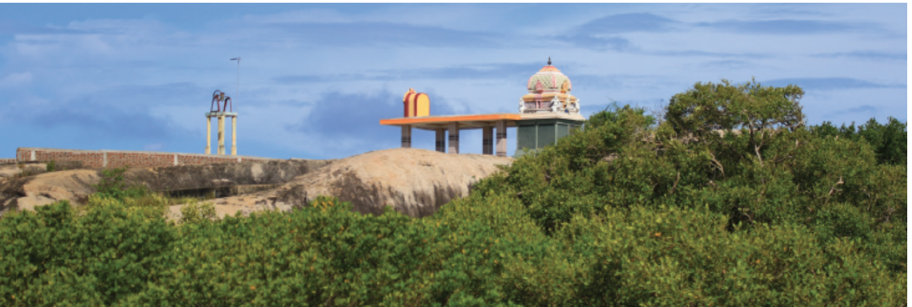
Okanda Temple is dedicated to Lord Murugan.