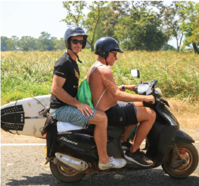
A frequent mode of transport.

restaurants come alive with great food. Street-side BBQs are lit up, with fresh seafood laid out. Mouthwatering cuisines from pizzas to Italian, Chinese, Indian, fusion and local favorites are prepared to enjoy. Soon parties begin with great beats and dancing music getting you grooving. Fireworks light up the night sky making Arugambay one big party! Early next morning, experience the beautiful Eastern sunrise as you relax along the beach and enjoy a refreshing sea bath, and rejuvenate with yoga to begin your day and continue with your wonderful holiday in Awesome Arugambay!