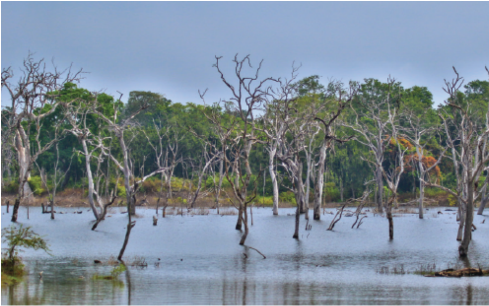
The tranquility of Lunugamvehera.