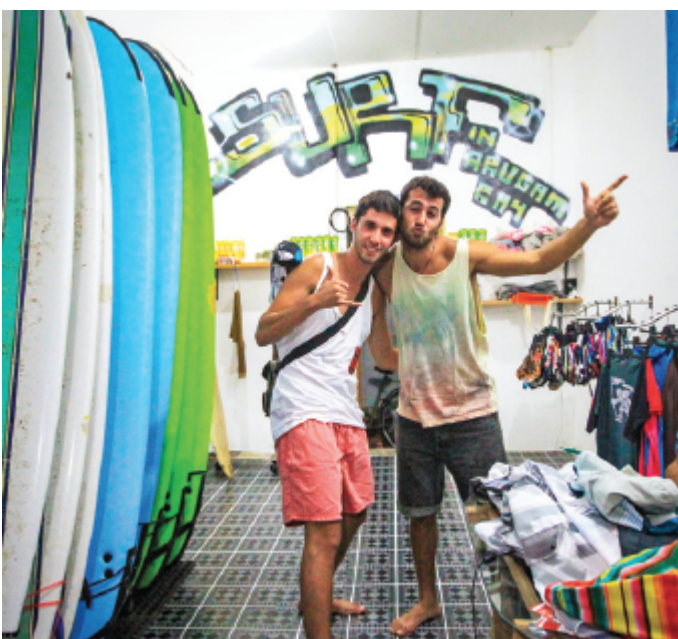
A photo moment.