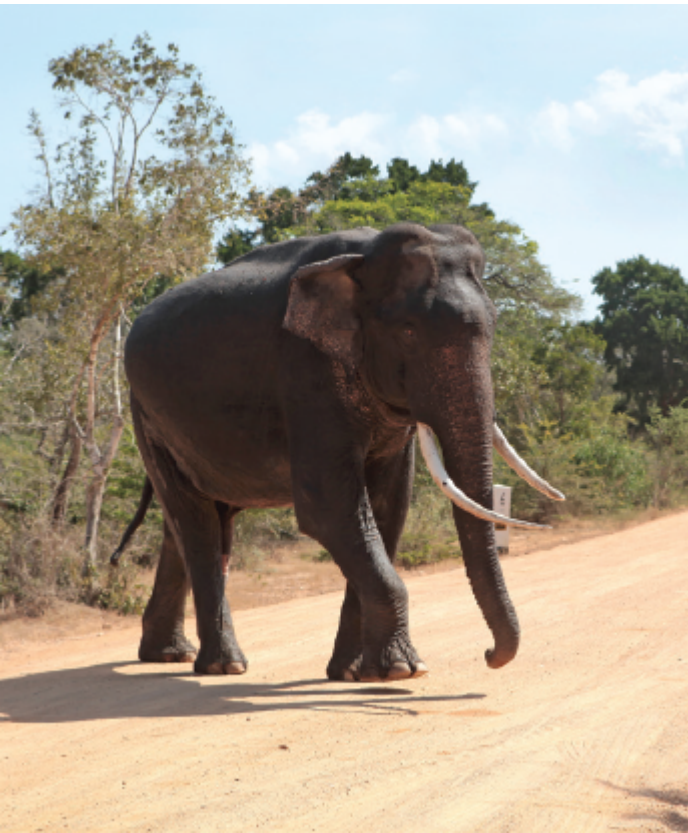
A giant tusker on the road in Kumana.