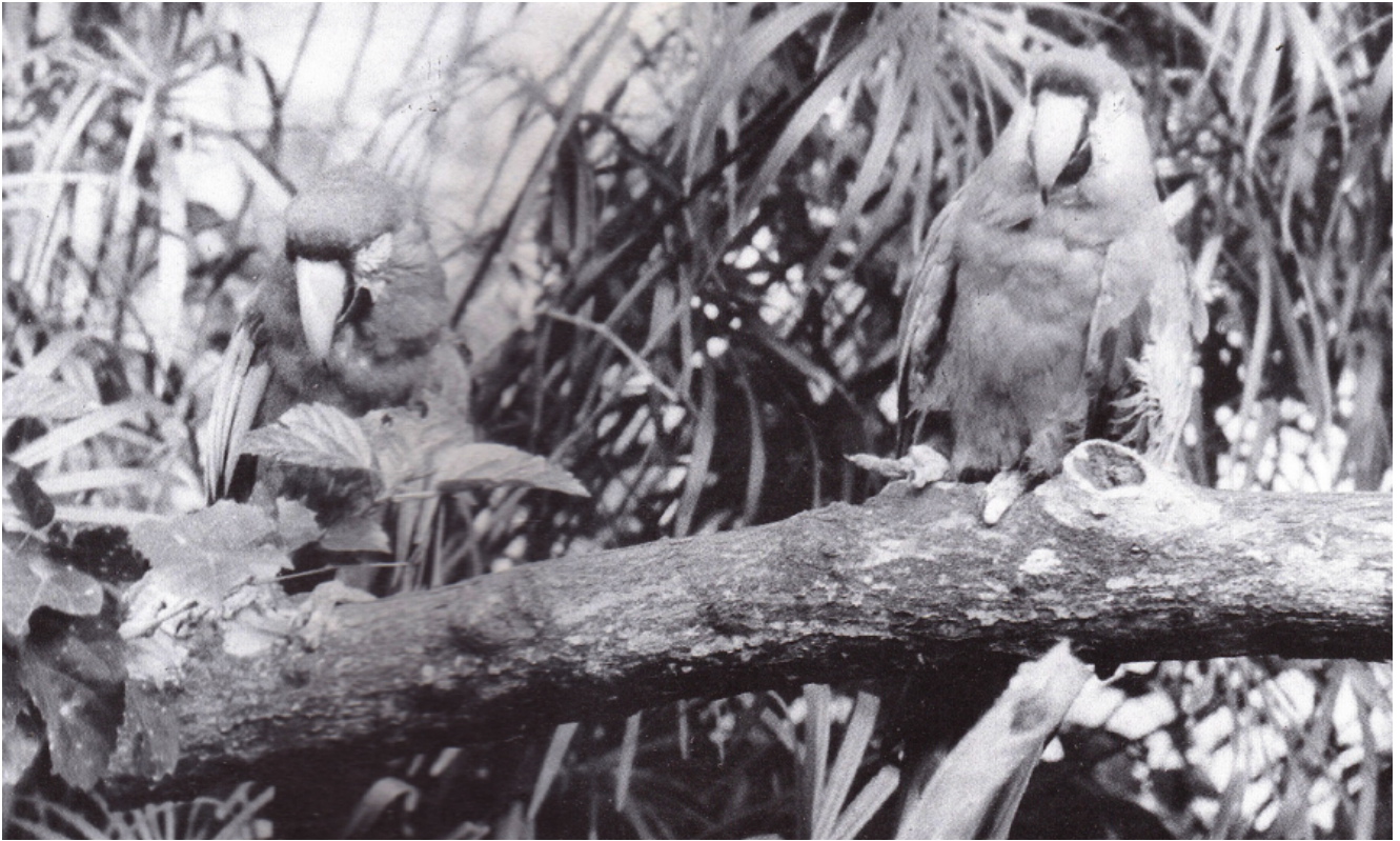
A pair of Red Macaws at the Dehiwel Zoo, the giant of the parrot family relaxing in a natural setting.