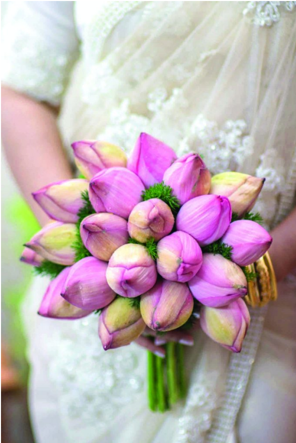
A reflection of ethereal and sheer simplicity.