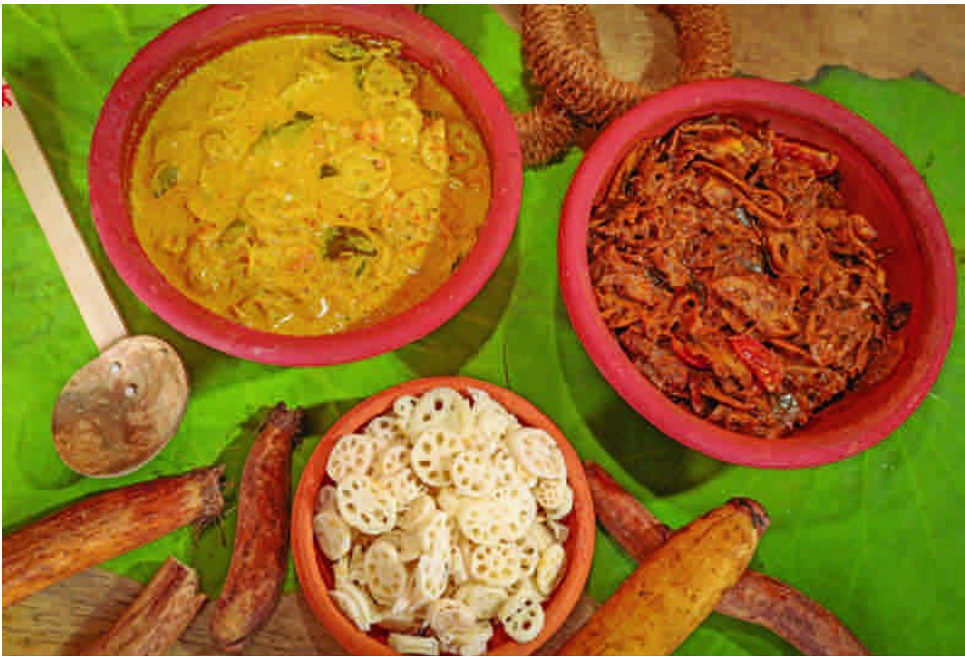
Tantalizing forms of Nelum ala (lotus roots) prepared in authentic styles of Sri Lankan cuisine.