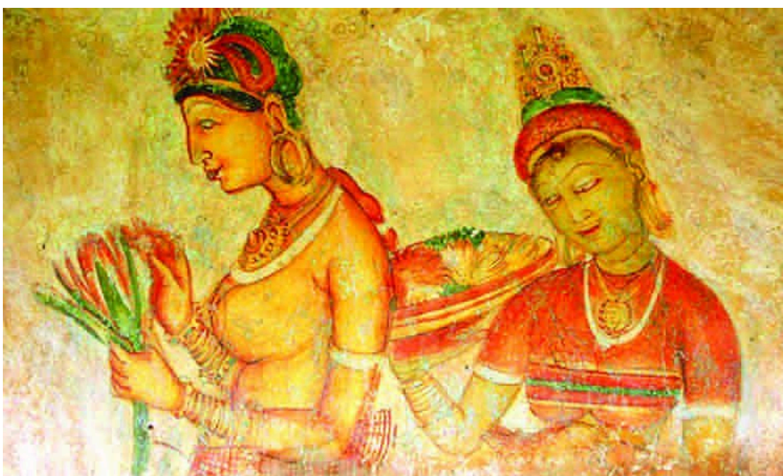
The frescoes of maidens at Sigiriya holding elegant lilies.

Lotus and water lilies dotting the serene lakes of the island evokes a sense of charm and serenity. Besides being ornamental beauties, these divine flowers are woven into the island's culture and tradition.