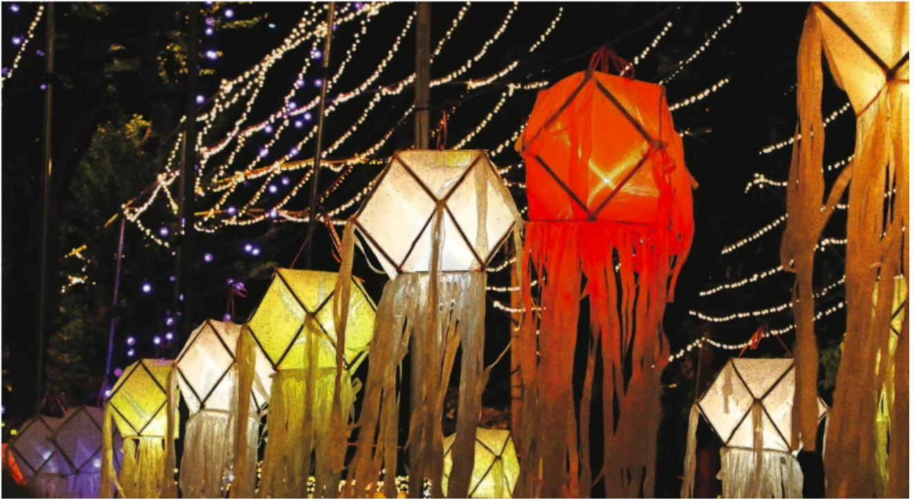
Colorful Vesak lanterns can be seen during Vesak festival.