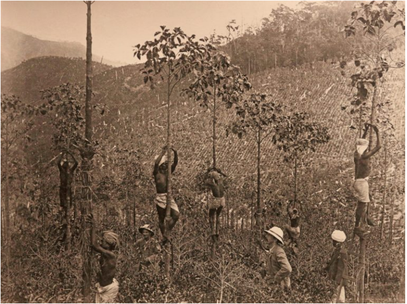
Cinnamon peelers (WLH Skeen & Co)

After the British gained control of the Island from the Dutch in 1796, they continued the state monopoly of the cinnamon trade, which had been introduced by their predecessors. Cinnamon was then the only major export crop, which fetched £8 per pound in weight, in London. But Ceylon's world monopoly of the cinnamon trade ended due to competition and the muddled policies of the British government. Instead, coffee, and later tea, eclipsed cinnamon, yet today Sri Lanka still provides a substantial share of the global market.