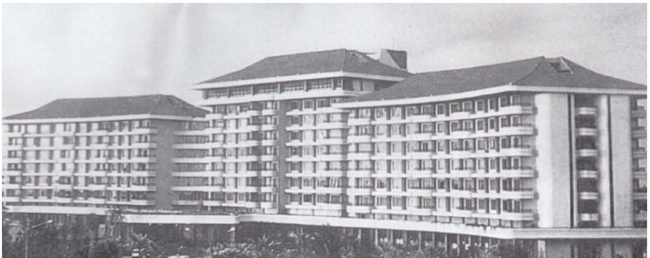
A view of the Taj Samudra at Galle Face.

All these hotels in Colombo are within close proximity to the various banks airline offices. shopping arcades and other tourist attractions of the city, the National Museum. Art Gallery. Vihara Maha Devi Park, Galle Face Green, Theatres, Handlooms Emporium. Golf and Rowing Clubs, Casinos, Night Clubs to name just a few. So whatever you are looking for at whatever price, Colombo gives you more than your money's worth in a standard of service and hospitality that is hard to match. (Note: all rates quoted are in US Dollars at time of writing in mid August 1987).