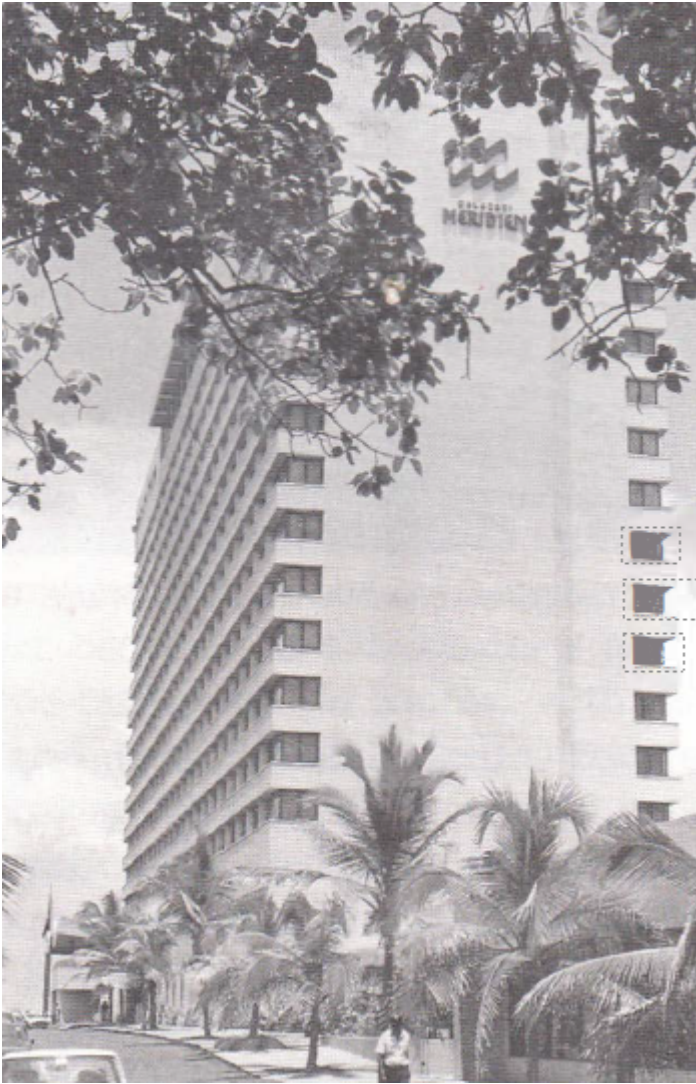
The Galadari Meridien at Lotus Road