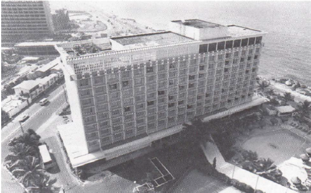
Hotel Ceylon Intercontinental, Colombo

When it comes to competitive pricing of hotels, there seems to be little to compare in South Asia, with what is now available in Colombo. Here, some of the best international names in hotels offer a wide range of facilities and services, at what are certainly gaining recognition as unbeatable prices. What makes the prices of Colombo hotels all the more attractive is the range of attractions, which Colombo is the gateway. The city, apart from being a busy business centre today, lets you in to some of the finest beaches in the western and southern coasts, the hill capital of Kandy, with its medieval charm, and the ancient cities of Anuradhapura, Polonnaruwa and Sigiriya, to name just a few of the attractions. But let's talk here of the Colombo hotels, and their super-competitive prices. Be ready for very pleasant surprises.