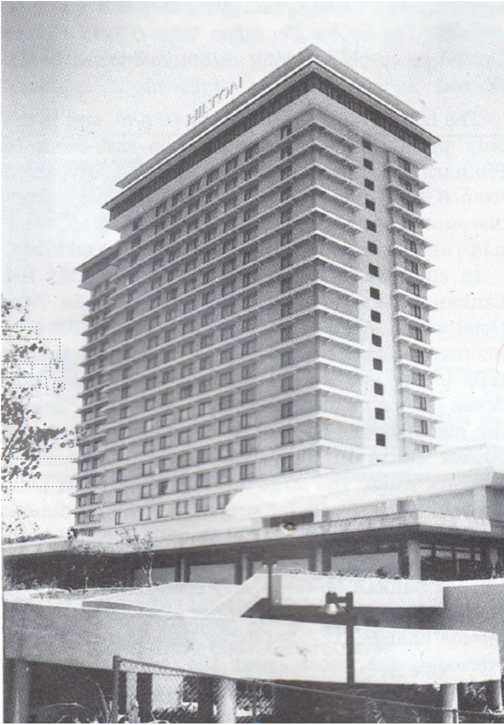
Hilton International, adding to Colombo's skyline.