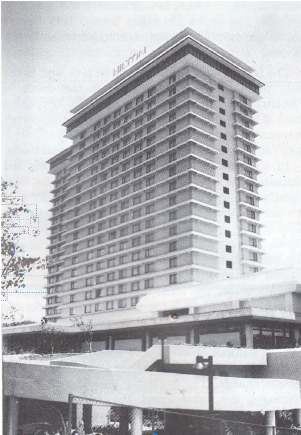
Hilton International, adding to Colombo's skyline.