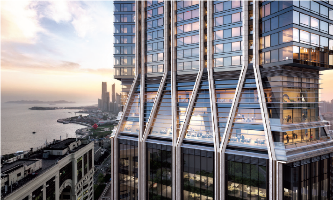
Cantilevered terraces offering panoramic views.