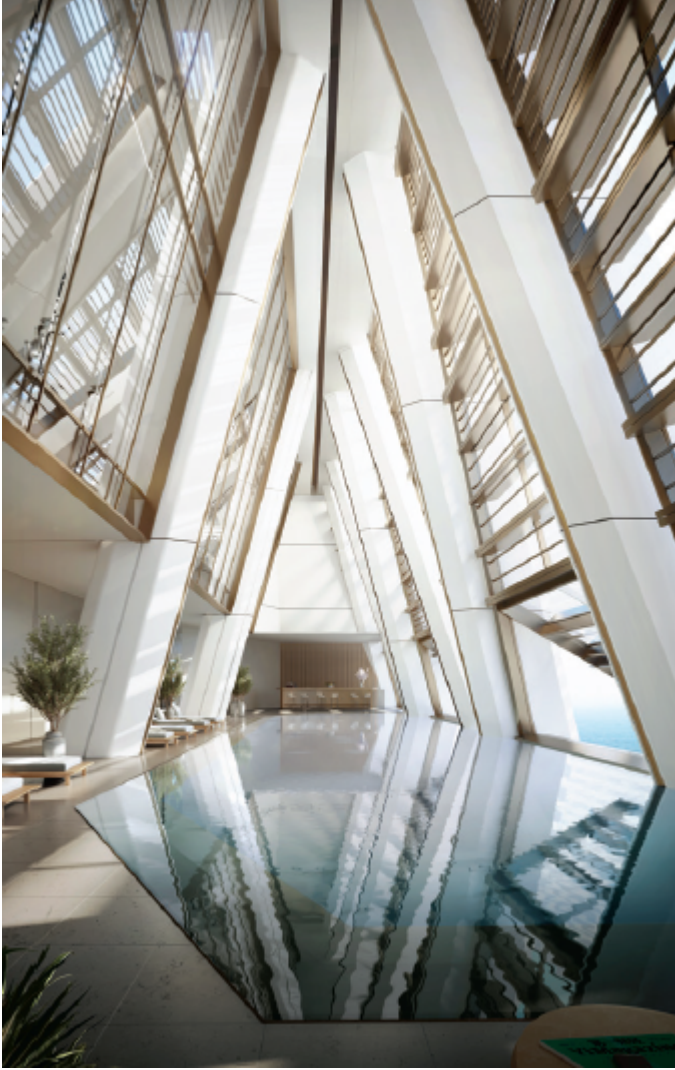
A west facing infinity pool.