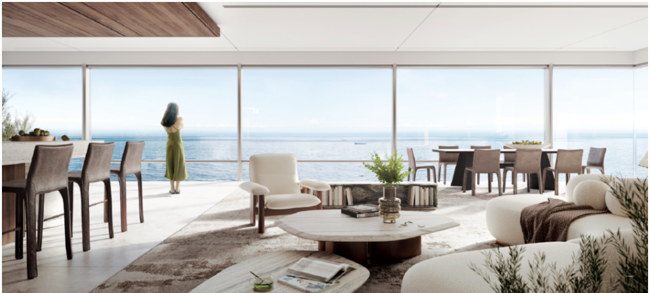
Rooms are naturally ventilated and optimised for energy consumption.