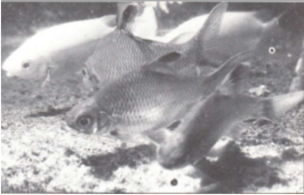
Kissing Gourami and Albino Fish. (Aruna Keerthisinghe)

safety among the stilt-roots are lovely iridescent beings with big, solemn eyes.