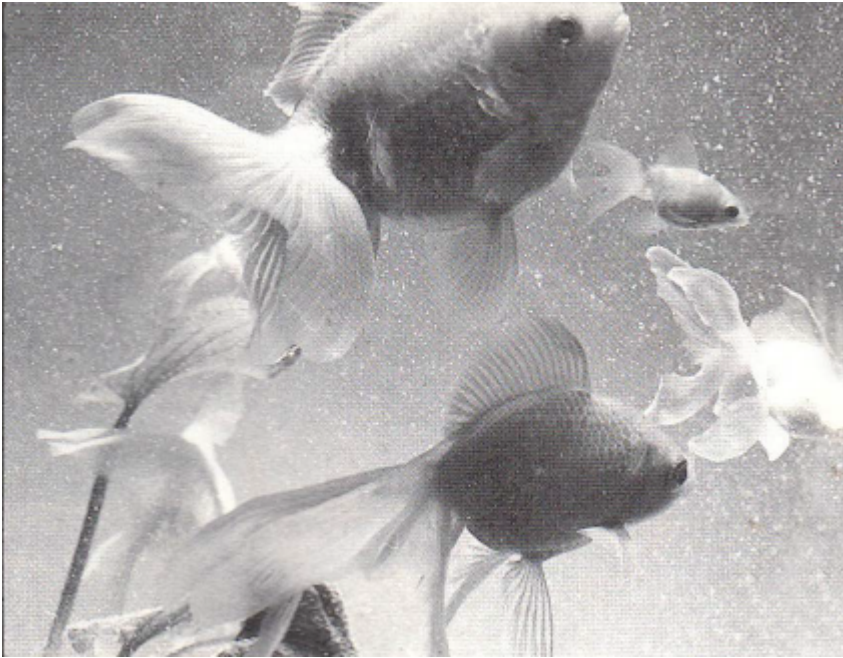
Goldfish in a home aquarium. (Aruna Keerthisinghe)

There are others too, from the inland streams, and they are all quite famous although not so famous as to be depicted on postage stamps and currency notes.