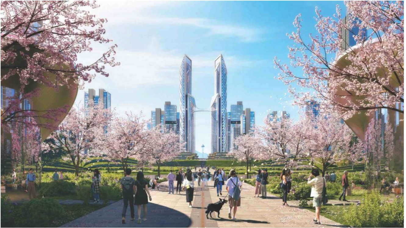
Center and above: focusing on the connection with nature.