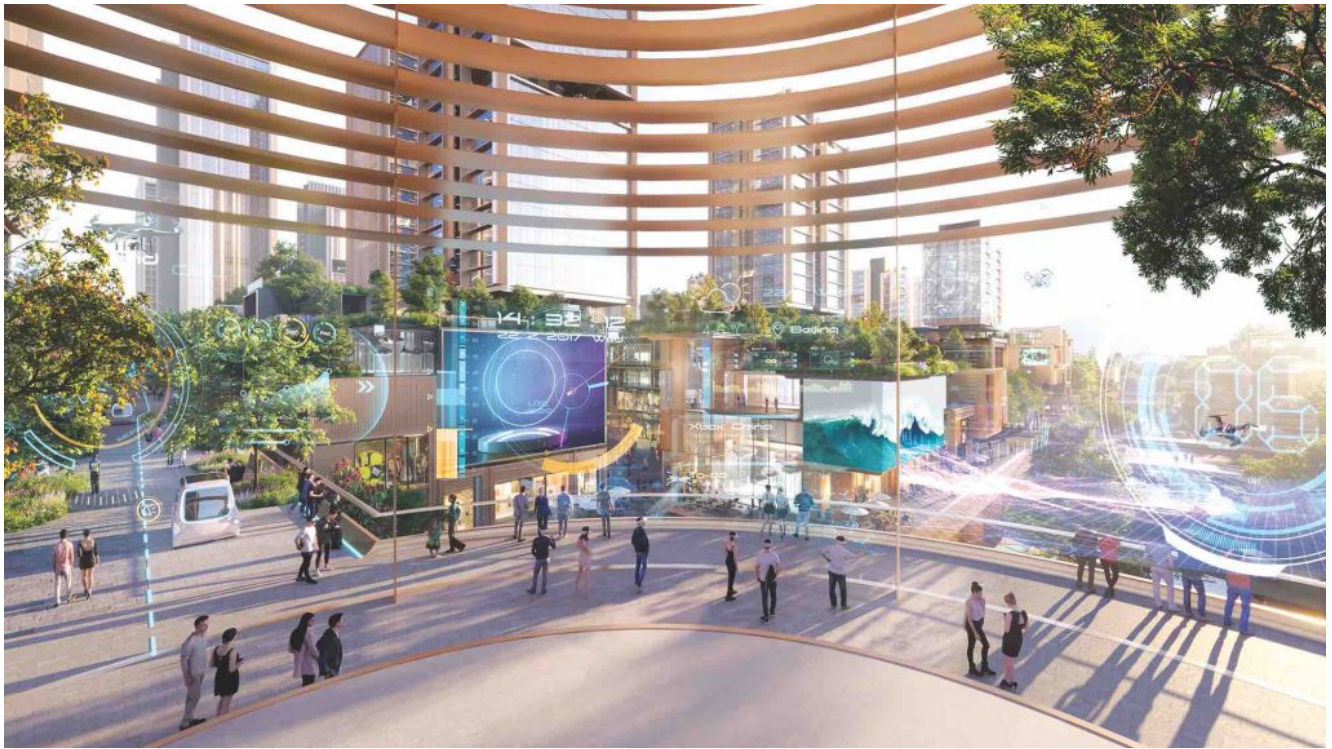
The concept merges nature and urban life.