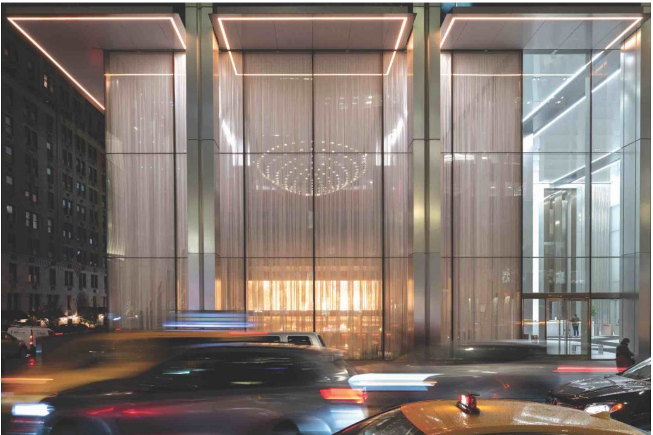
Every design element is carefully chosen.