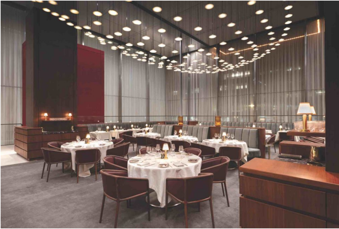
Bespoke lighting and fine dining spaces are some of the highlights.