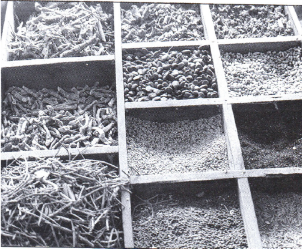
Dried herbs and grain in storage boxes in a shop down Gaba Lane. (Suresh de Silva)