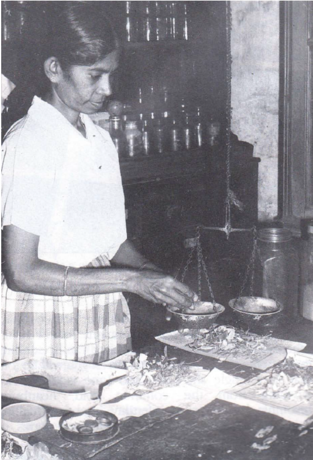
Measuring medicinal herbs to a prescription. (Suresh de Silva)