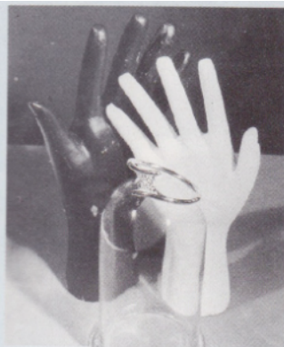
An armlet worked in gold.