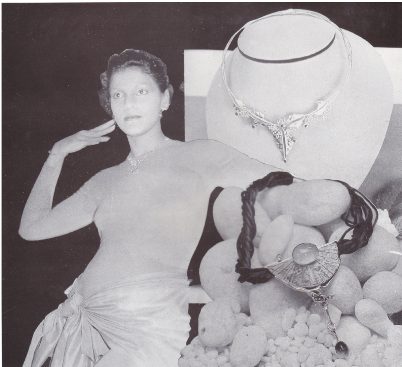
A model displays some interesting jewellery at the exhibition.

For today's fashion conscious women and men, this display of jewellery gave a much needed glimpse of the variety of design and style now available in Sri Lanka and held promise of much more vogue creations in the future.