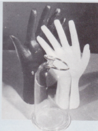
An armlet worked in gold.