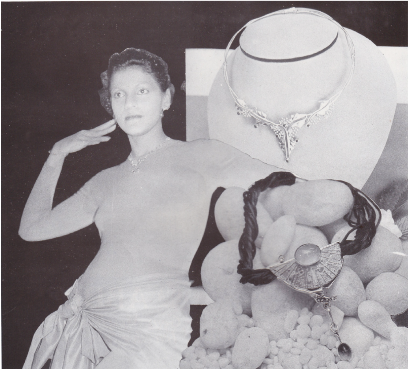
A model displays some interesting jewellery at the exhibition.

For today's fashion conscious women and men, this display of jewellery gave a much needed glimpse of the variety of design and style now available in Sri Lanka and held promise of much more vogue creations in the future.