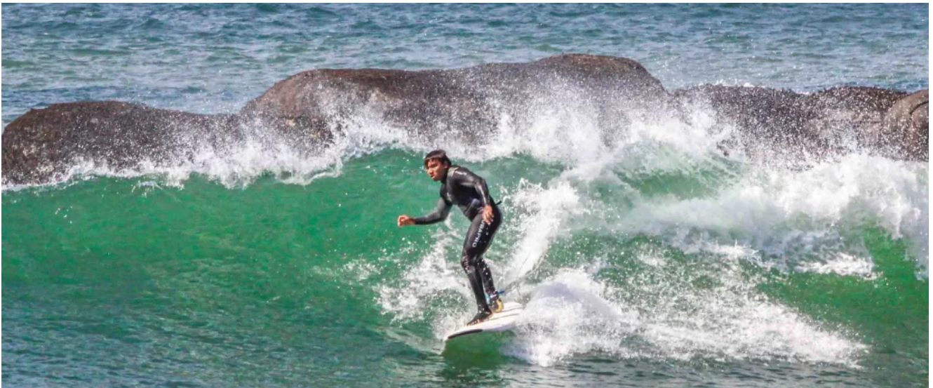
Namal Rajapaksa, Minister of Youth and Sports surfing in Unakuruwa, Tangalle. He is the one and only Sports Minister to surf in the world.