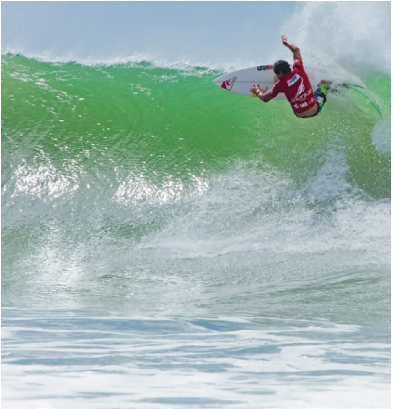
Australian Julian Wilson in Arugambay during the Association of Surfing Professionals tournament.