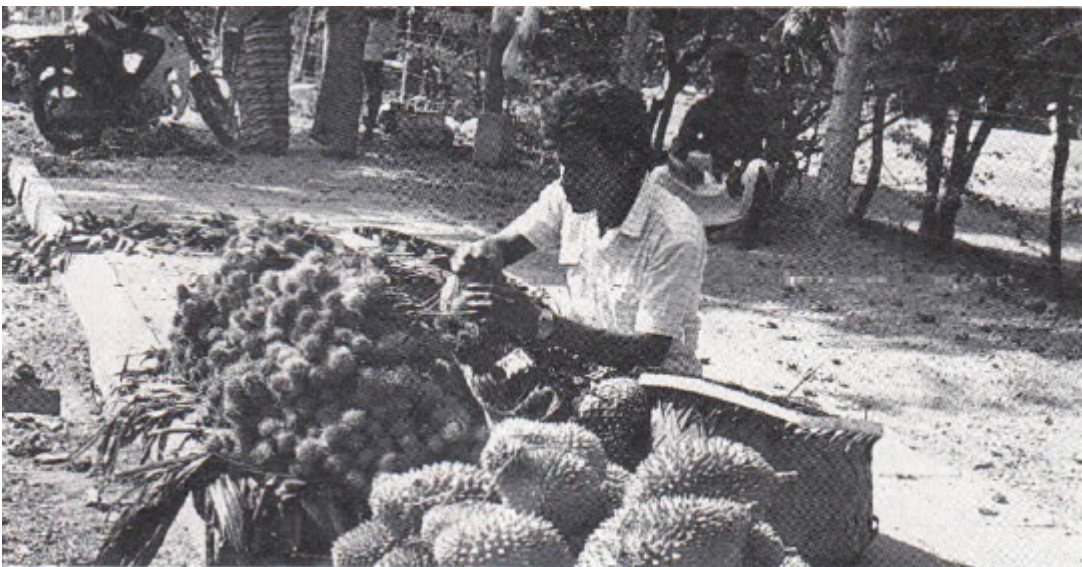
A city fruit seller awaits customer.