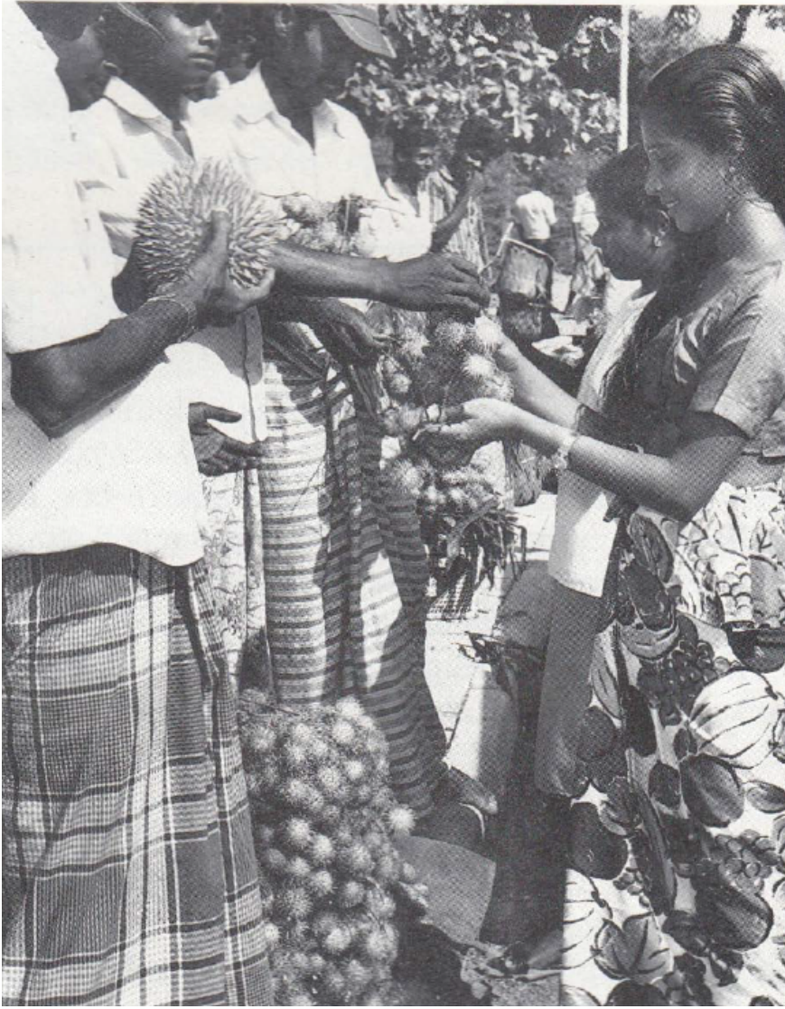
A young girl buys Rambutan at the kerb.