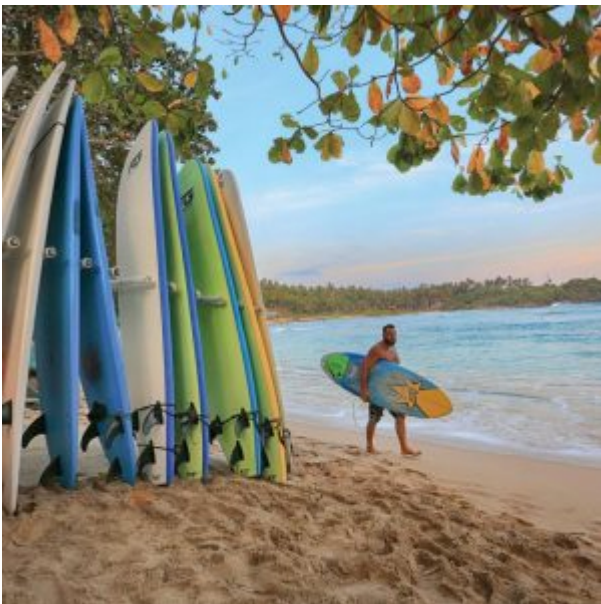
Grab a board and hit the waves - a perfect surf point for beginners