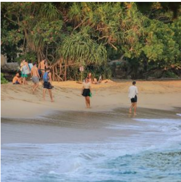
The cove is also perfect to enjoy with friends