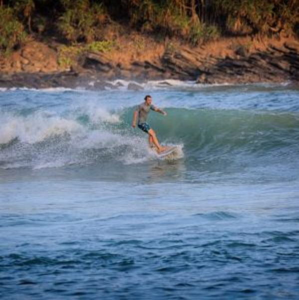
A race against the breaking wave