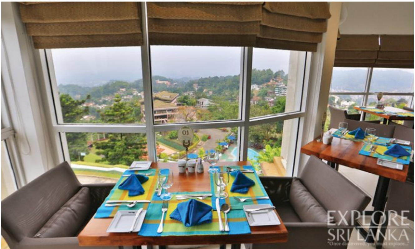
Dine while enjoying stunning vistas at Sky Lounge

unique getaway for each guest. The first floor is the 'Water Lilly floor', which offers a range of comfortable twin-bed rooms. The corridors of this floor are furnished with little fish tanks on which a brightly lit tiny oil lamp is kept to add an ornamental charm and this feature extends to the tastefully decorated rooms. The cement wall finishes complement wooden touches and vibrant décor within spacious interiors. Each twin-room features modern amenities and has an en-suite bathroom with a chic marble bathtub.