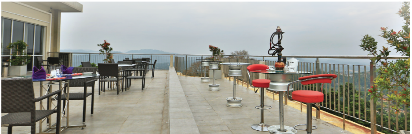
Snack on as you enjoy fascinating views from the Sky Lounge terrace