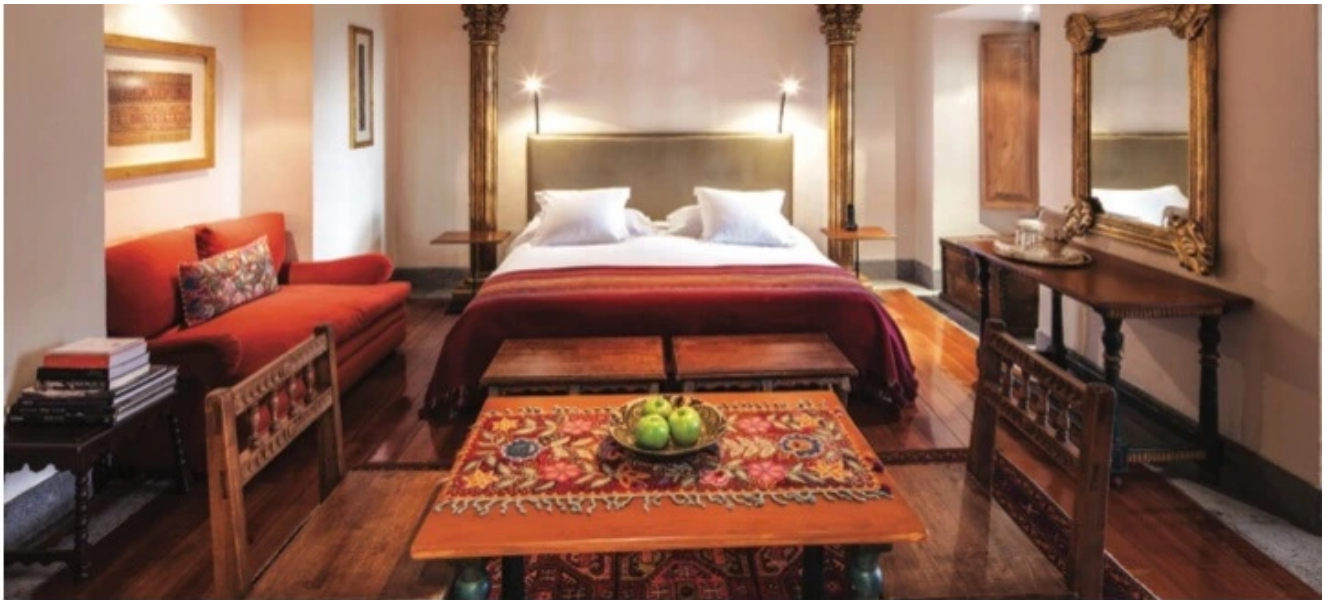
The patio suite is furnished with amenities for a cozy stay.