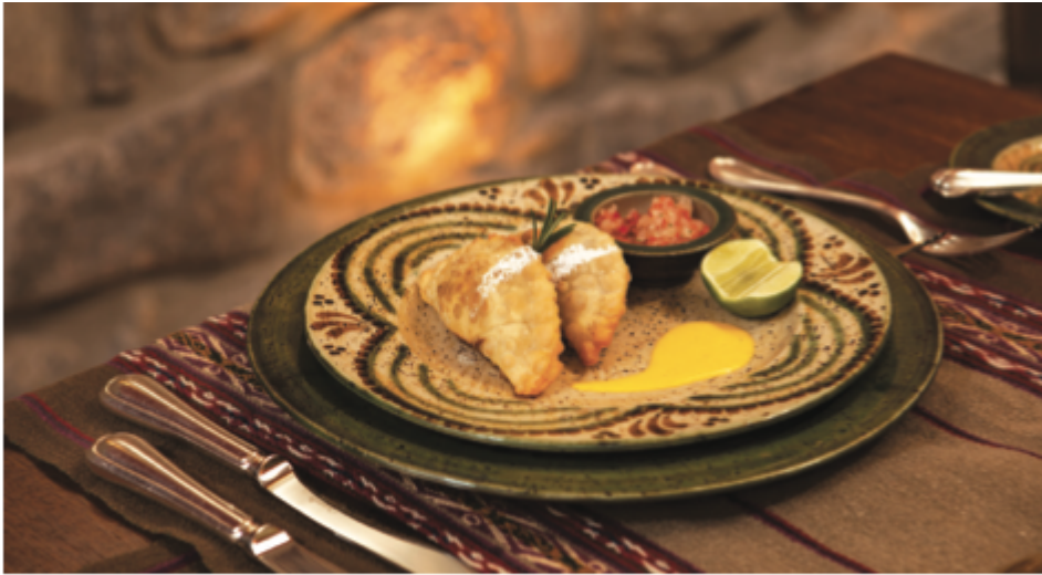
The food served at the manor's dining room is fresh, natural and nutritious.