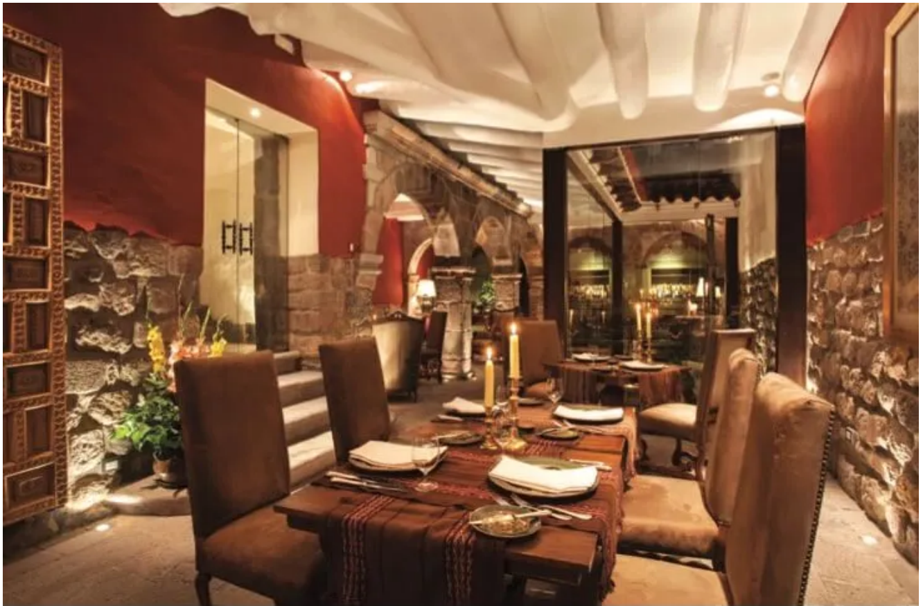
Enjoy a fine dining experience coupled with native culinary traditions.