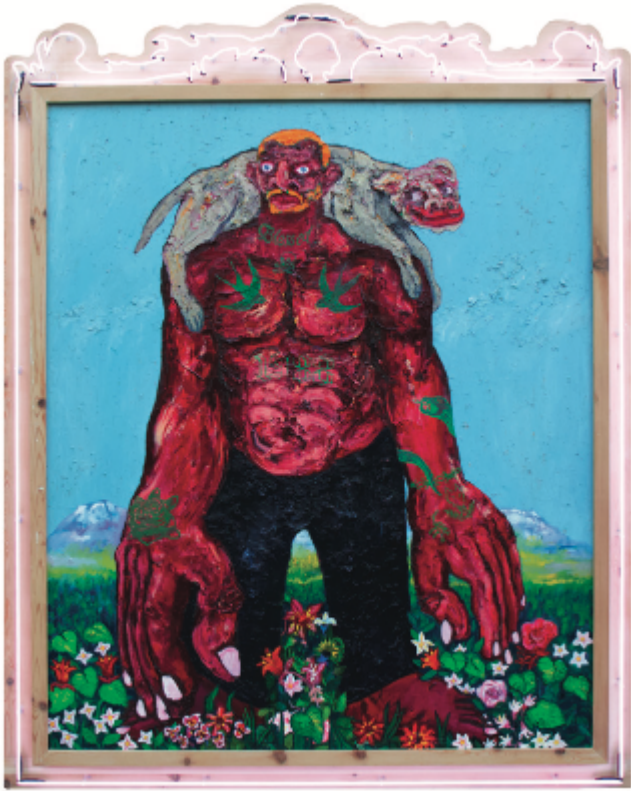
By Ramazan Can - The Smiling Man-Self-Portrait. The Man Who Makes Gulistan-Self-Portrait, Oil on canvas, neon, wood (232x186x1cm, 2022)