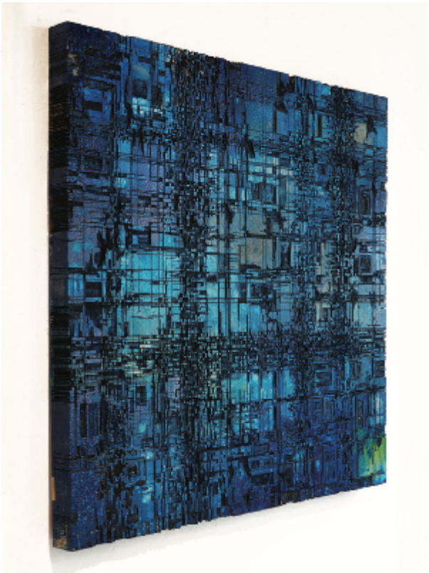
By Mathias Hornung - Digital Deep Blue 3, Wood printing, offset ink, birch plywood (150x150x10cm, 2022)