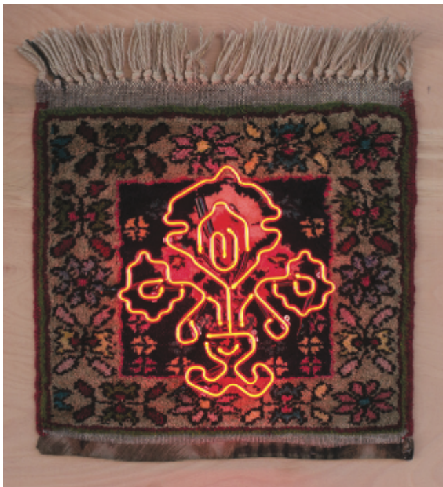
By Ramazan Can - Fragments from a currently worked, Neon weaving (69x60.5cm, 2020)