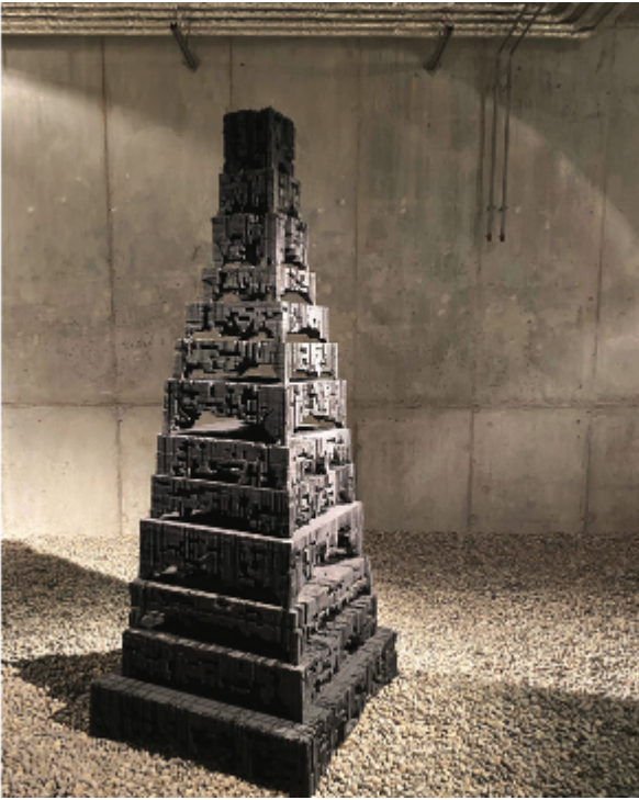
By Mathias Hornung Pyramide, sculpture disp paint on construction board (240x100x 100cm, 2017)