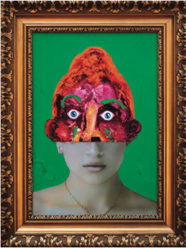
By Ramazan Can - The desire to become more Beautiful, Oil on canvas (50x35cm, 2021)