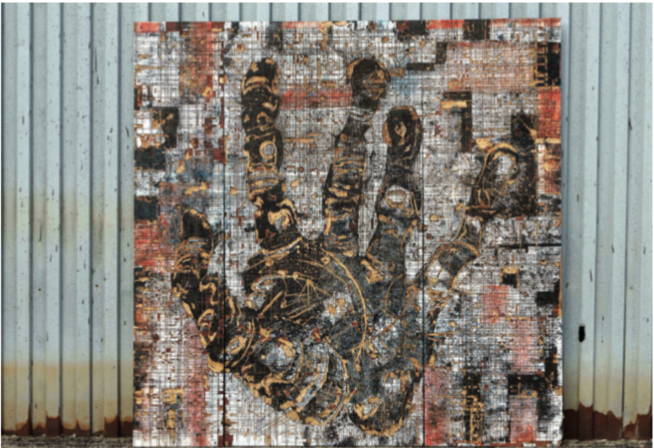
By Mathias Hornung Palm - Printing block, offset ink on construction board (234x250x2cm, 2019)