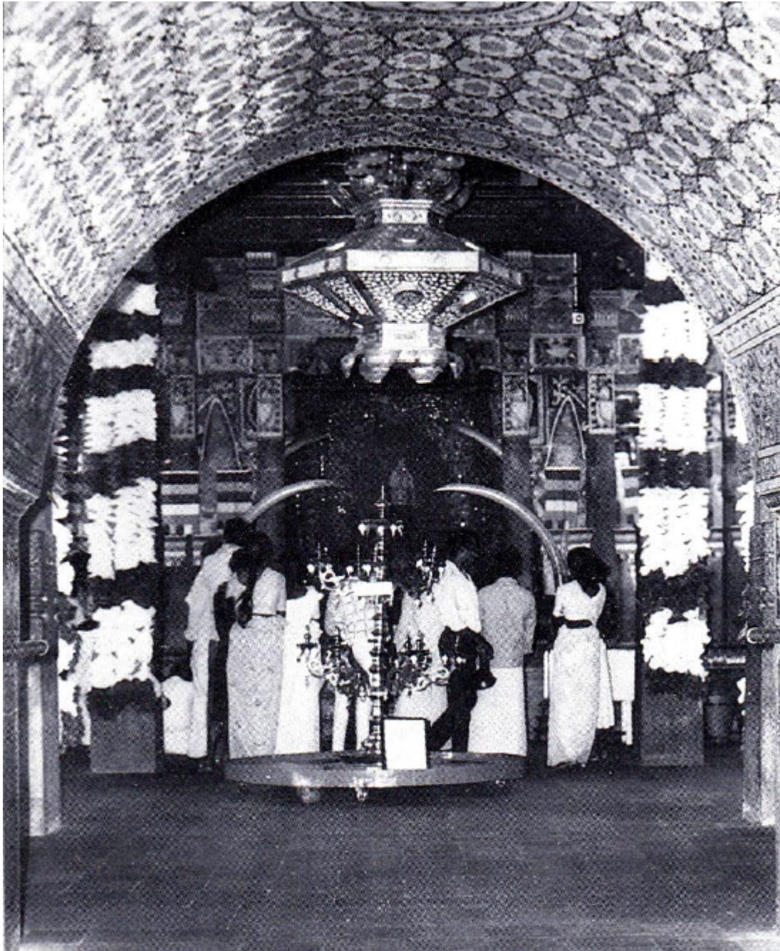
Devotees worshipping at the inner hallway of the Dalada Maligawa.