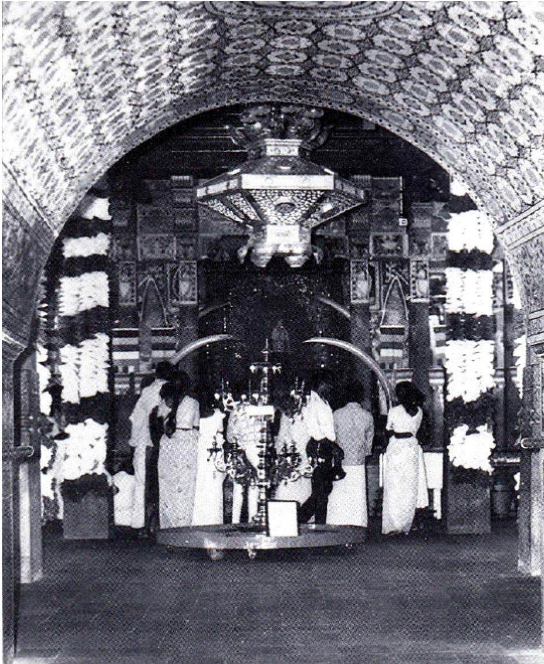
Devotees worshipping at the inner hallway of the Dalada Maligawa.