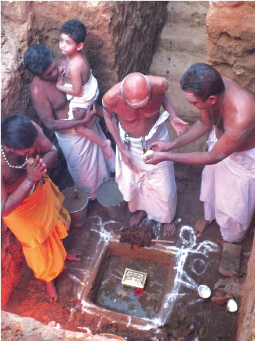
Laying of the Holy foundation for the Northern entrance Tower 'Kubera Raja Gopuram' in 2012. Along with son and grandson, which is recorded today as the island's biggest Gopuram (to date).