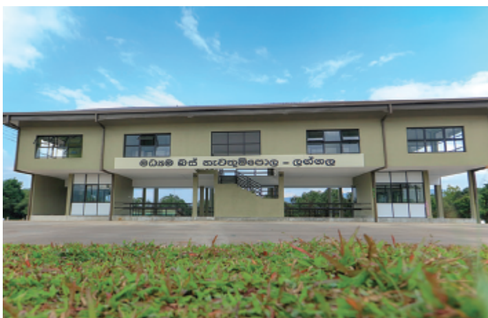
The Central Bus Stand is located conveniently, providing easy access.