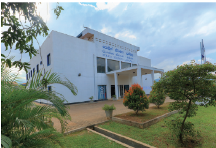
The Police Station is an eco-friendly space.