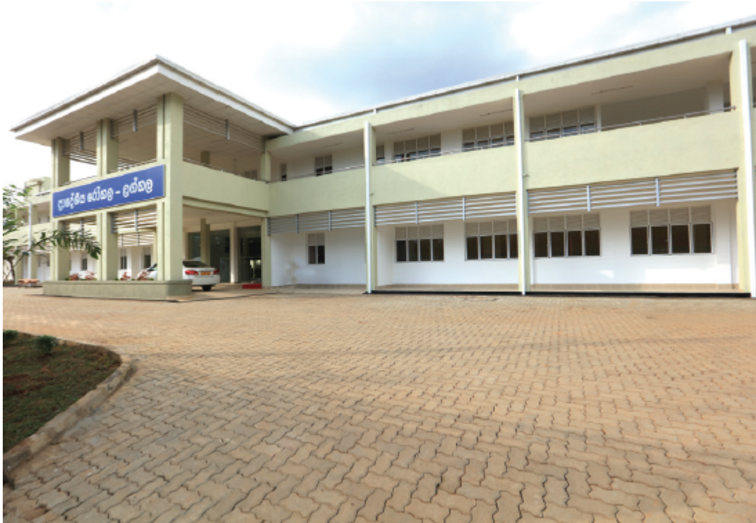
The Divisional Hospital is fully functional despite being established recently.