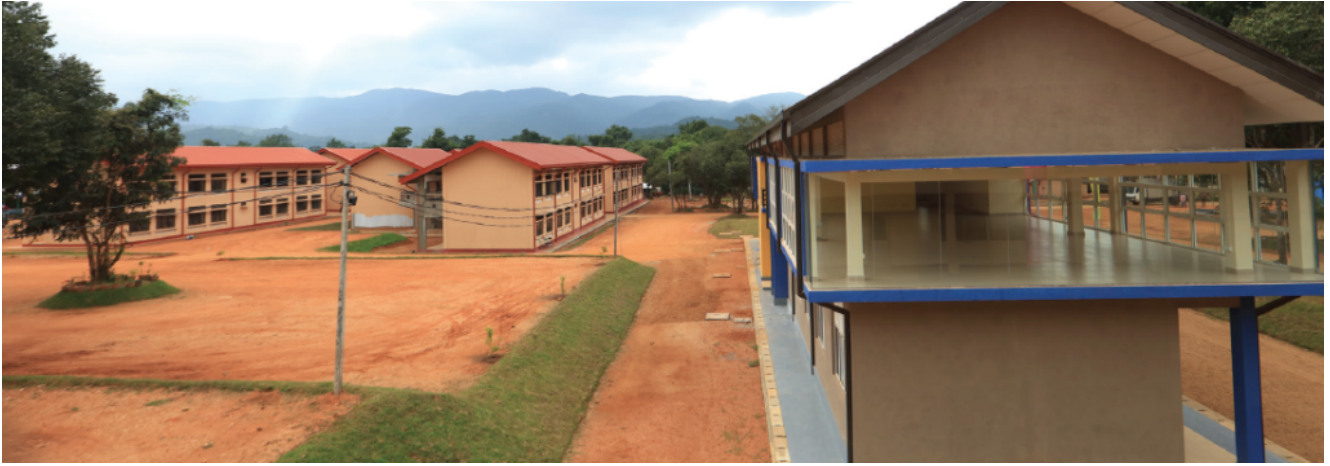
The Pallegama Central College is one of the five schools built in the Laggala Green Town.