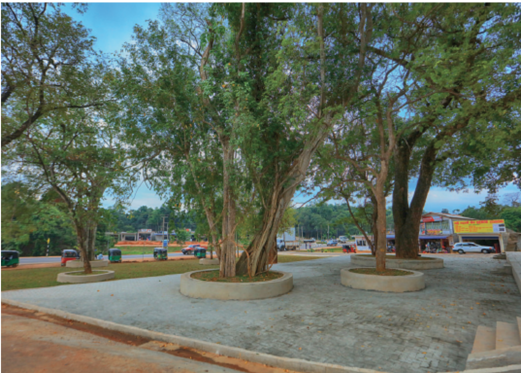
The town's green square is surrounded by growing retail outlets.