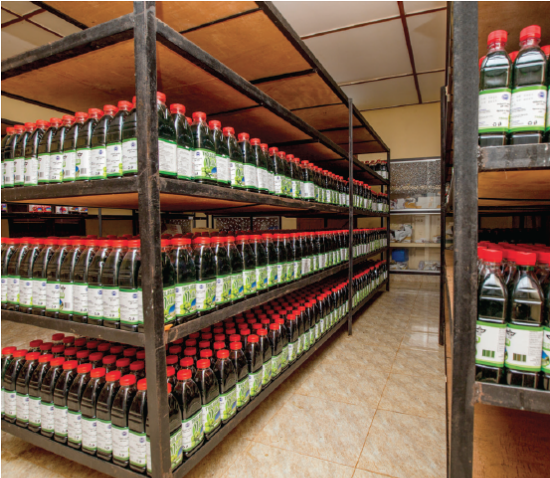
All set for the shelf to the home - finished bottles of Nell Crush waiting to be distributed to shops.