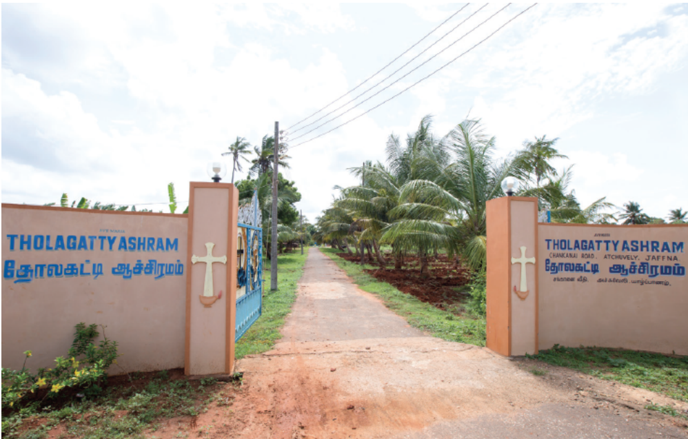
Entrance to the Rosarian Congregation's monastery now located at Achcuveli, Jaffna.