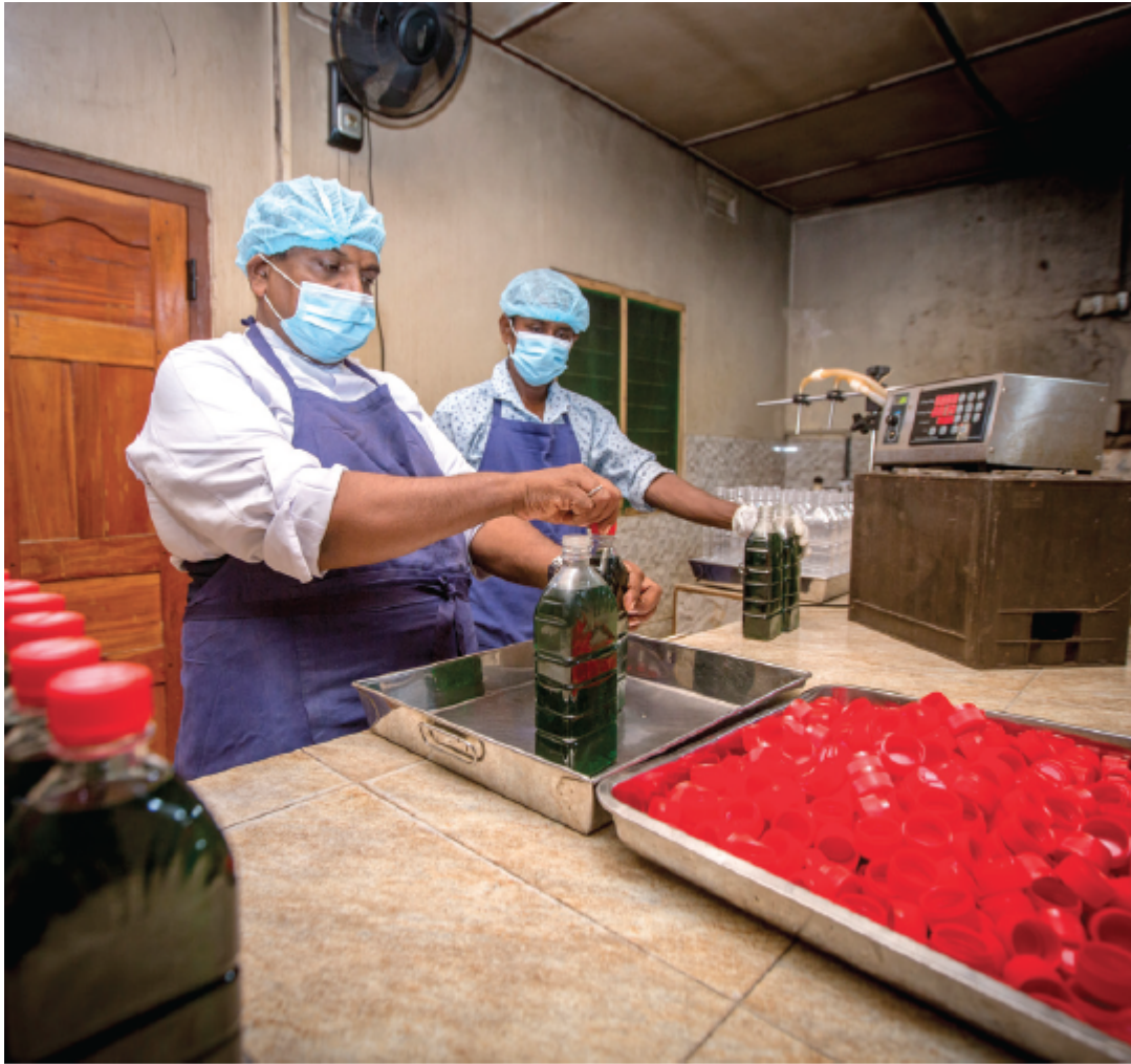
Ready to be sealed.