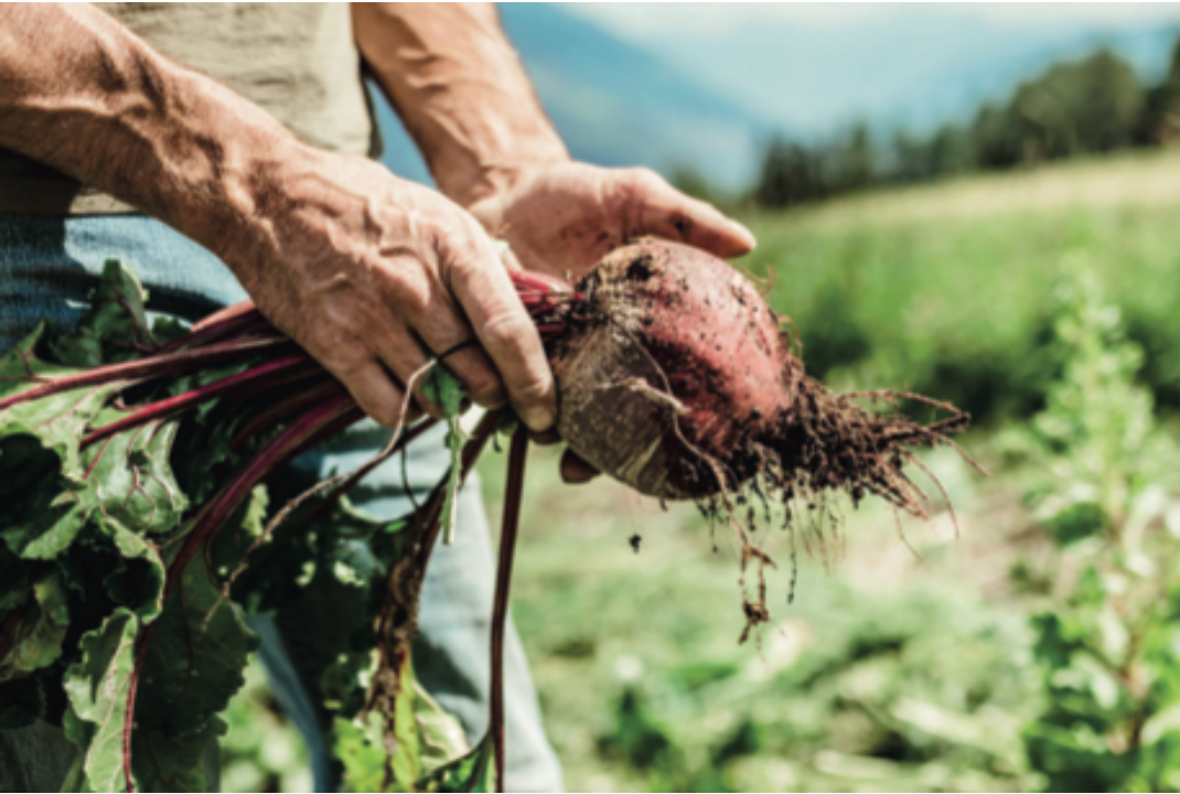
Gardening at Adler Lodge RITTEN.