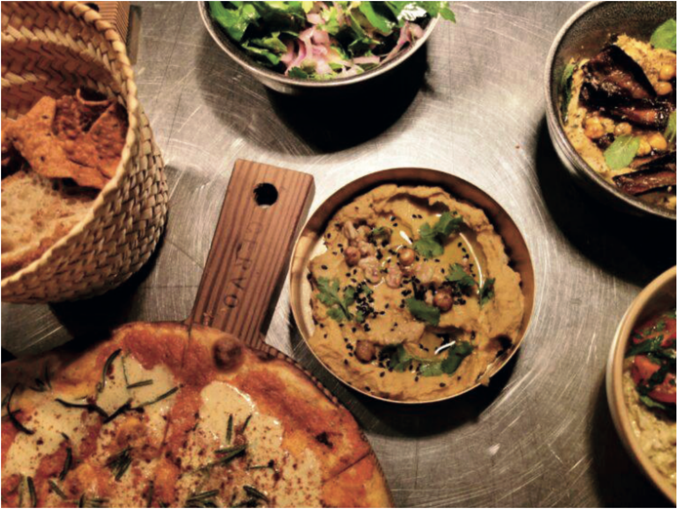
Food at Cervo mountain resort.