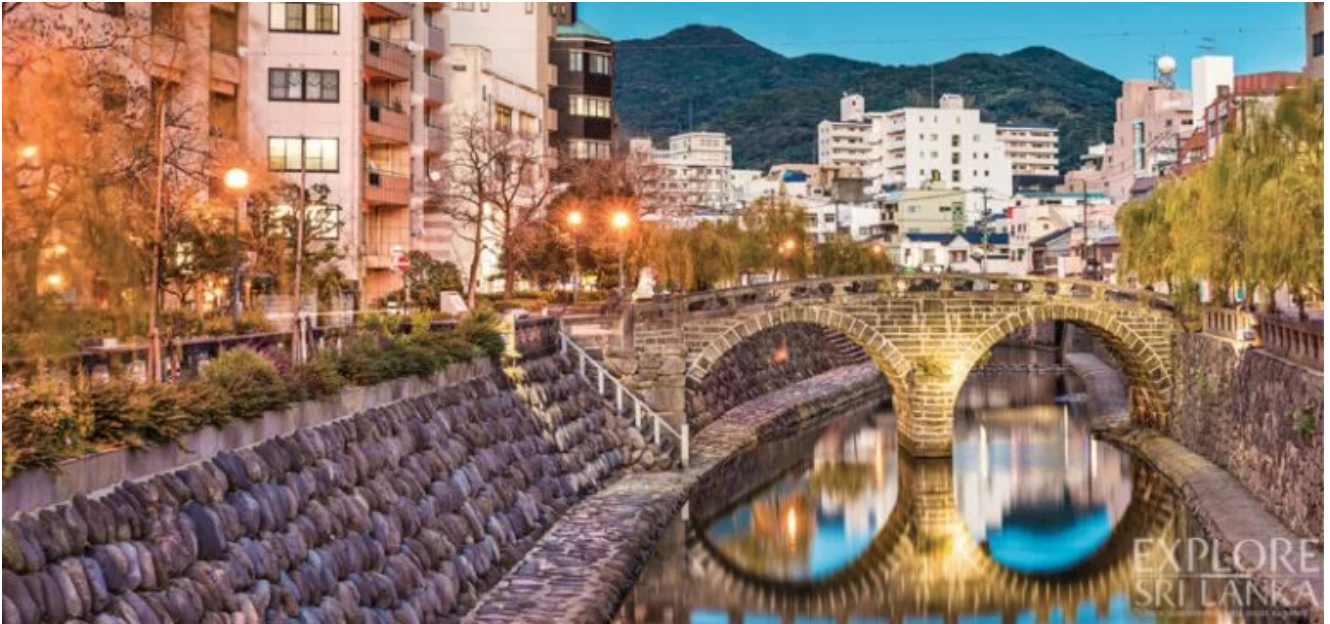
Nagasaki's identity transcends one violent act