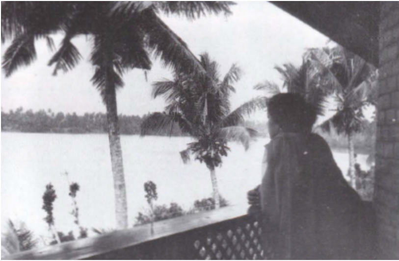
A view of the Kalu Ganga flowing by. from the balcony of a room at the Meriviere