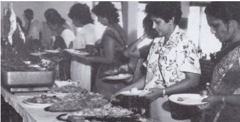
The Meriviere's Restaurant serves a sumptuous Sunday buffet.