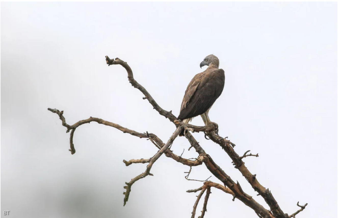
Grey-headed fish eagle.