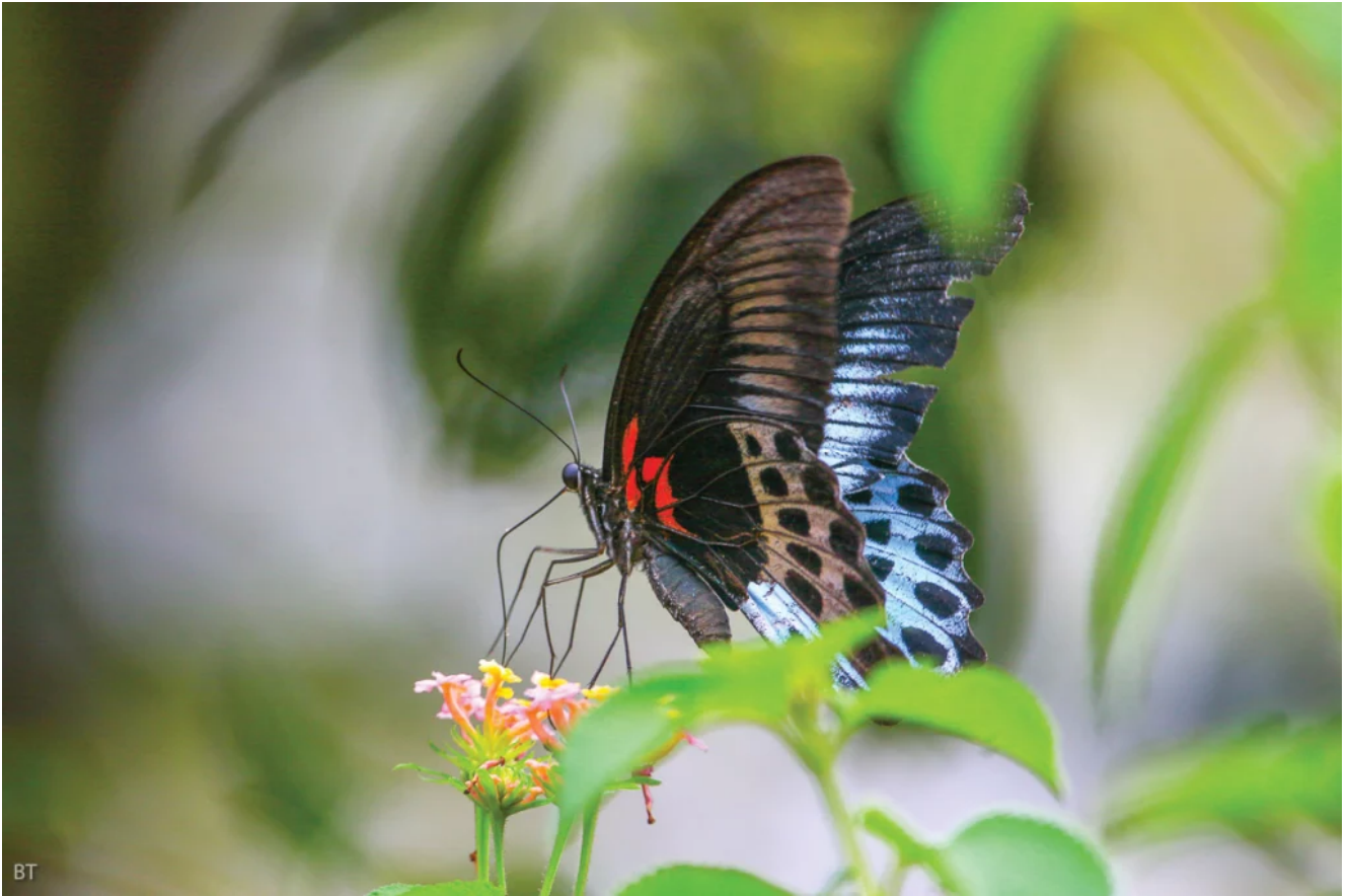
A vibrant butterfly feeds on nectar.