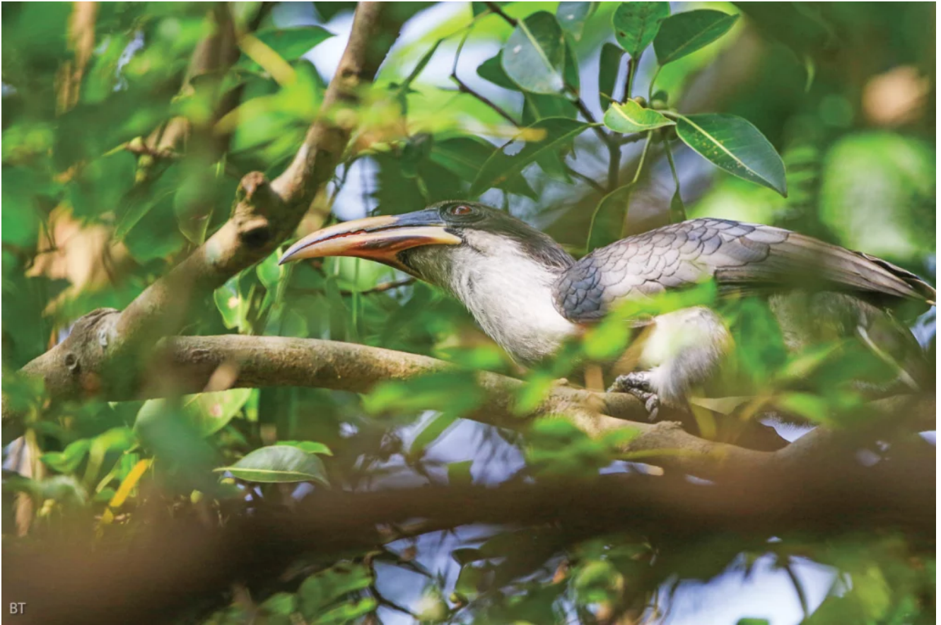
Sri Lankan grey hornbill perched on a branch.