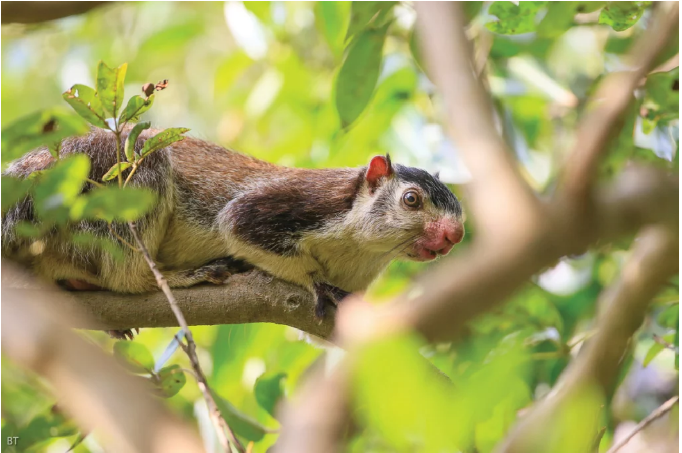
A watchful giant squirrel (Dandulena).