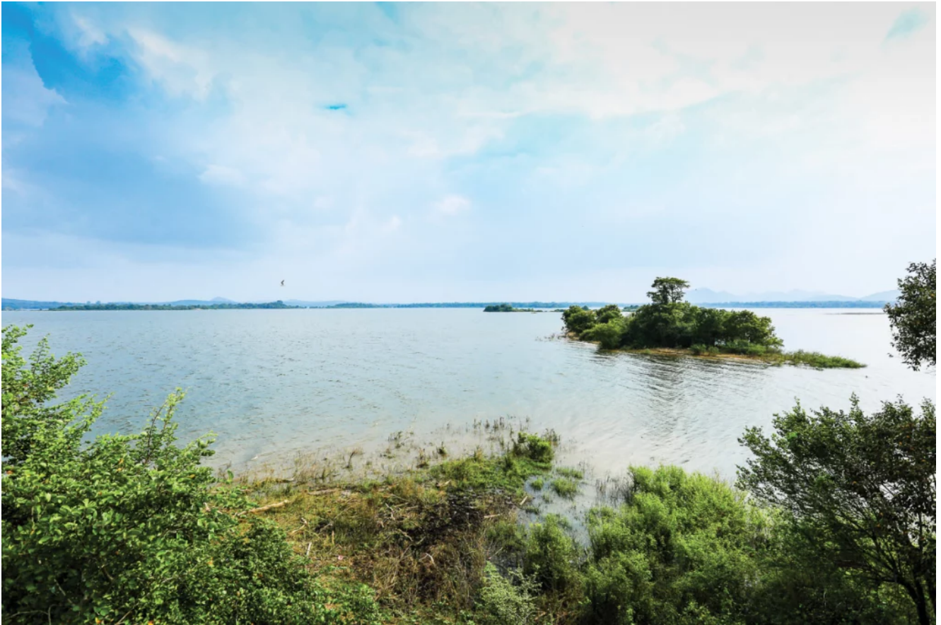
The expansive Minneriya reservoir sustains the biodiversity of the park.