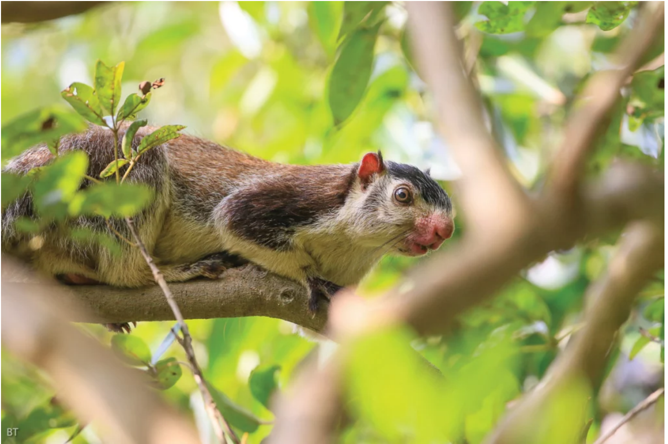
A watchful giant squirrel (Dandu lena).