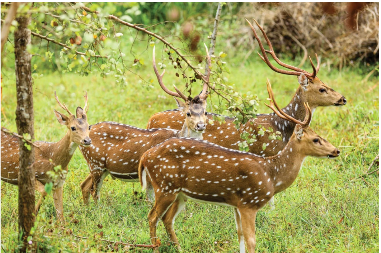
Spotted deer nibbling leafy greens.