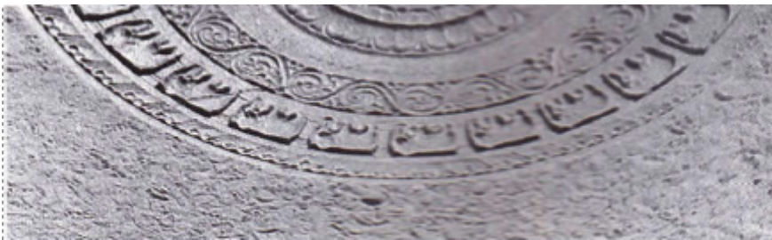
A moonstone at Kelaniya temple patterned with elephants and geometric designs.

the Anuradhapura era the sculptor seems to have exercised a degree of fine-tuned precision and skill which made him the master of his craft, enabling him to mould unyielding stone to his wishes, with ease. However, the moonstone craftsmanship of the Polonnaruwa period, though the artistic precision guiding the chisels of the Anuradhapura sculptor had been lost somewhere along the way. Ancient art forms are indeed the gem of Sri Lankan culture, a worthy legacy bequeathed by generations past, now immortalised by their contributions to the richness of Sri Lanka's cultural heritage.