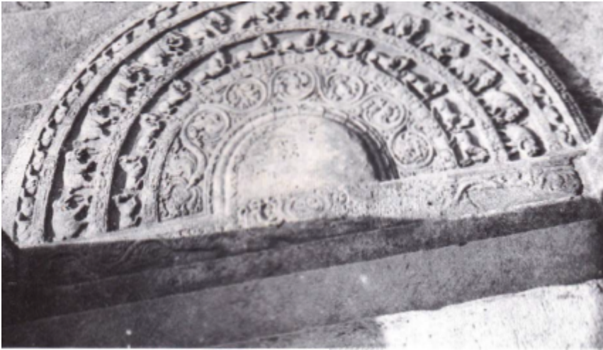
Rows of swans, elephants and horses on the moonstone at the Vatadage at Polonnaruwa