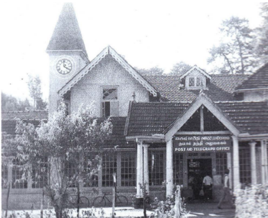
The old Post Office building in Nuwara Eliya – with the spire.

Nuwara Eliya then is no ordinary hill town. It offers the visitor great natural beauty combined with a unique glimpse of a part of Sri Lankan history that is preserved, almost untouched, in its rarified mountain air.