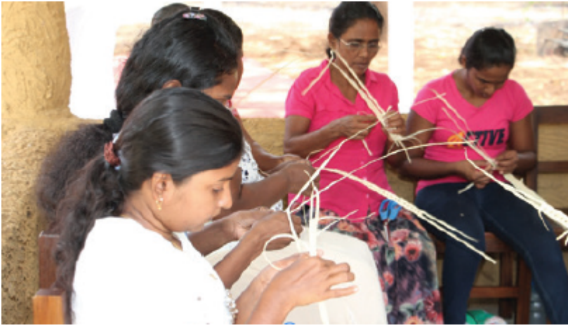
Weavers deftly work on creating unique designs.