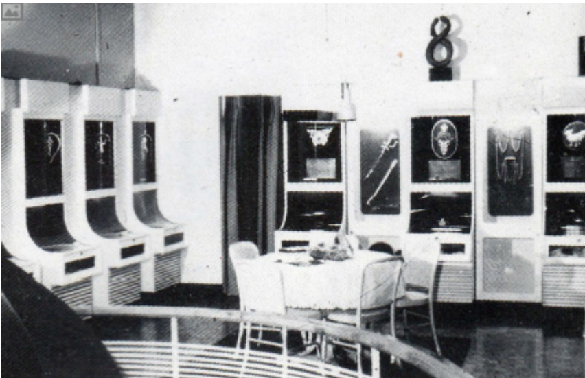
Some of the exhibits on display at the Nilani Gem Musuem Ratnapura.