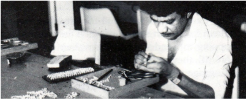
A skilled craftsman making fine jewellery at Nilani Gem Exports.