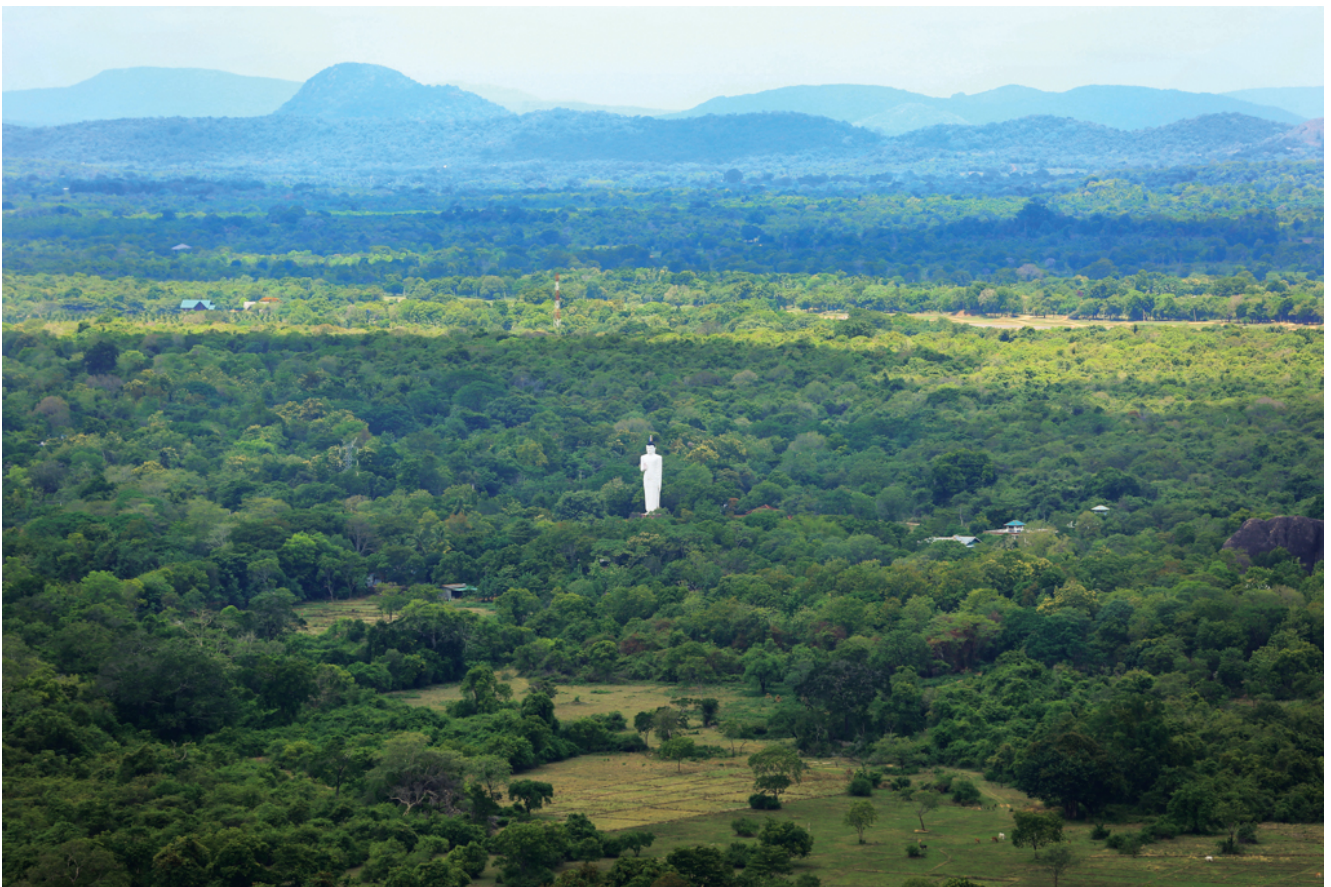
The pristine white Buddha statue of the Sigiriya temple rises above lush greenery.