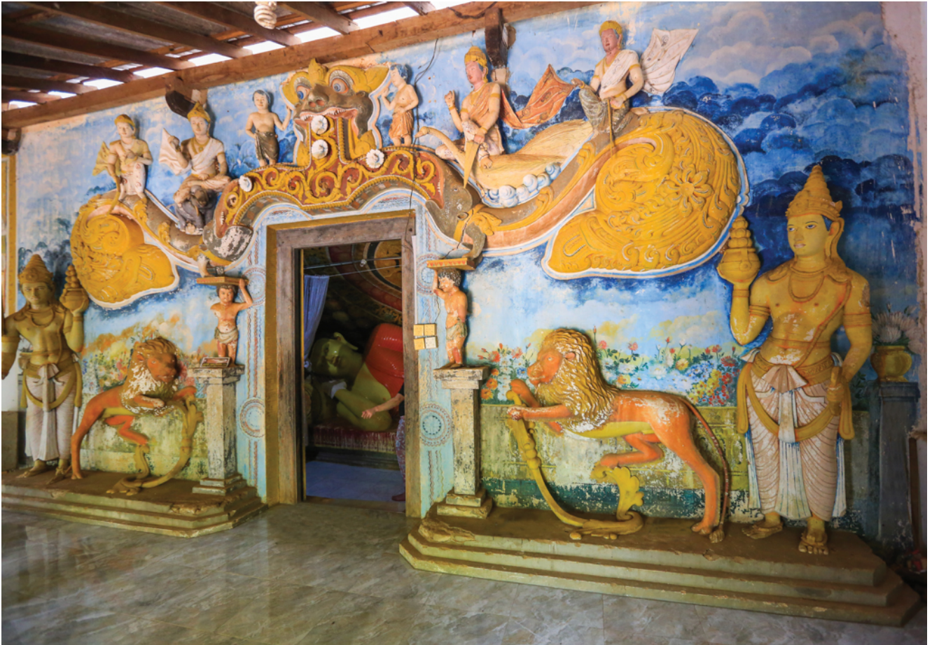
The Image House at the base of the rock.