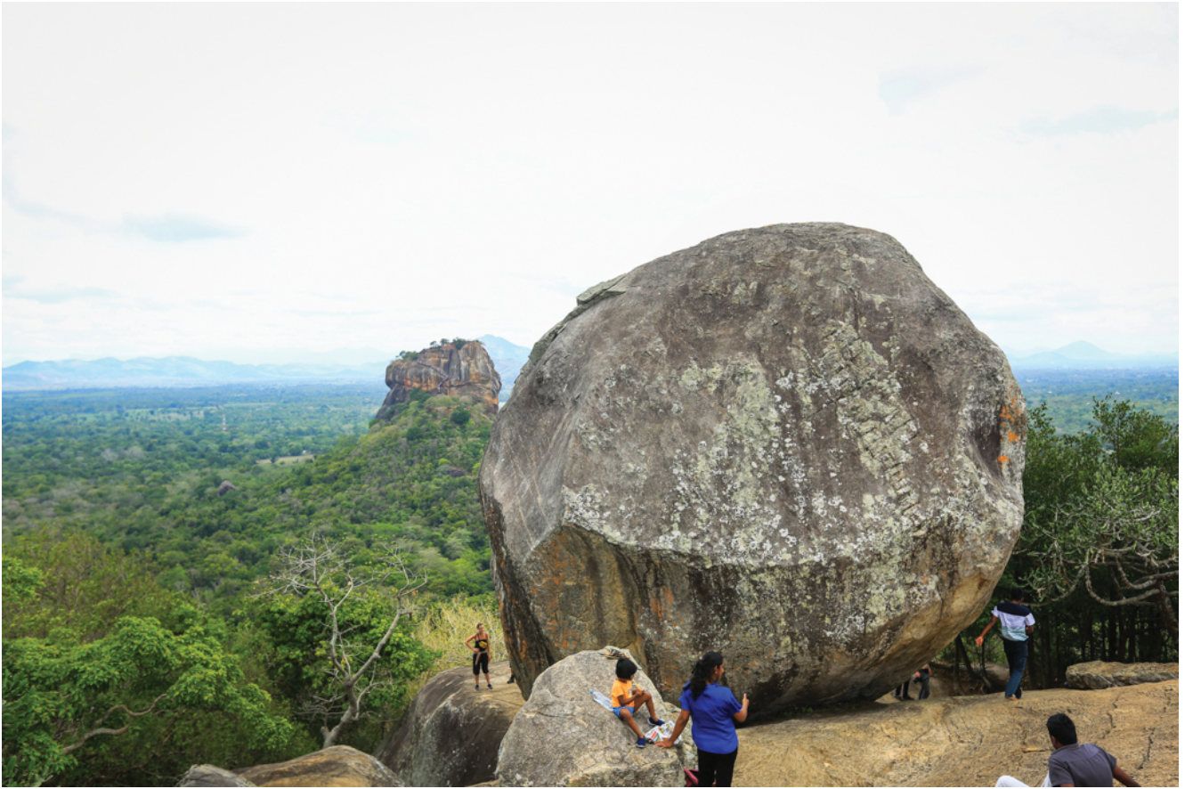
Visitors enjoy panoramic views of the ancient citadel and beyond.