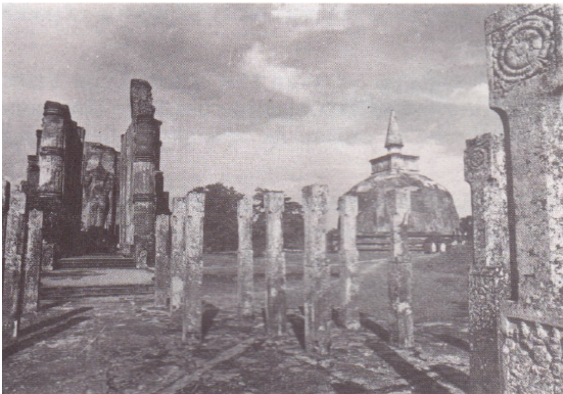
Lankatilaka Vihara and Kiri Vehera.

The 6.7 m tall erect figure of a man in a cross-armed pose, found nearby, is commonly believed to be that of Ananda, the Buddha's friend and favourite disciple. His restrained grief at the Buddha's passing is skilfully captured in stone in this, the best of the Gal Vihare sculptures.