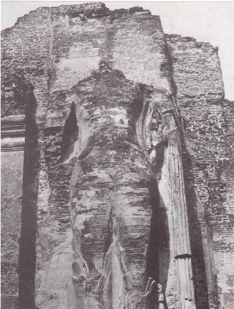
The gigantic headless statue of the Buddha at Alahana Pirivena.

The rock shrine found beyond the standing Buddha statue houses an image of the Buddha in a sitting posture. The background of the statue is ornamented with carvings of pagodas and quaint designs. The tranquility of the enlightenment that permeates this image leaves one in no doubt that the sculpture is the work of a master-hand. As one gazes at these colossal statues standing in mute testimony to a glory long passed, it seems inconceivable that they have been exposed to centuries of sun and rain.