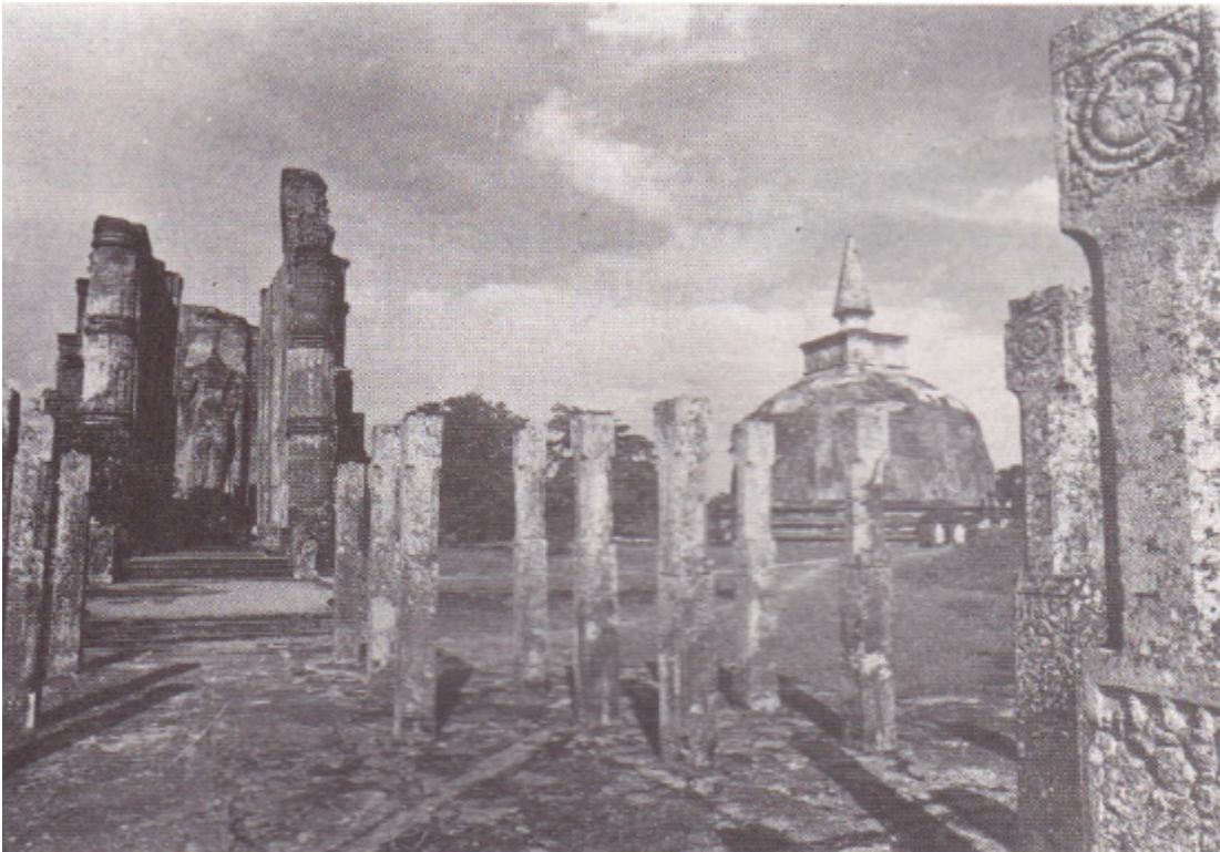
Lankatilaka Vihara and Kiri Vehera.

The 6.7 m tall erect figure of a man in a cross-armed pose, found nearby, is commonly believed to be that of Ananda, the Buddha's friend and favourite disciple. His restrained grief at the Buddha's passing is skilfully captured in stone in this, the best of the Gal Vihare sculptures.