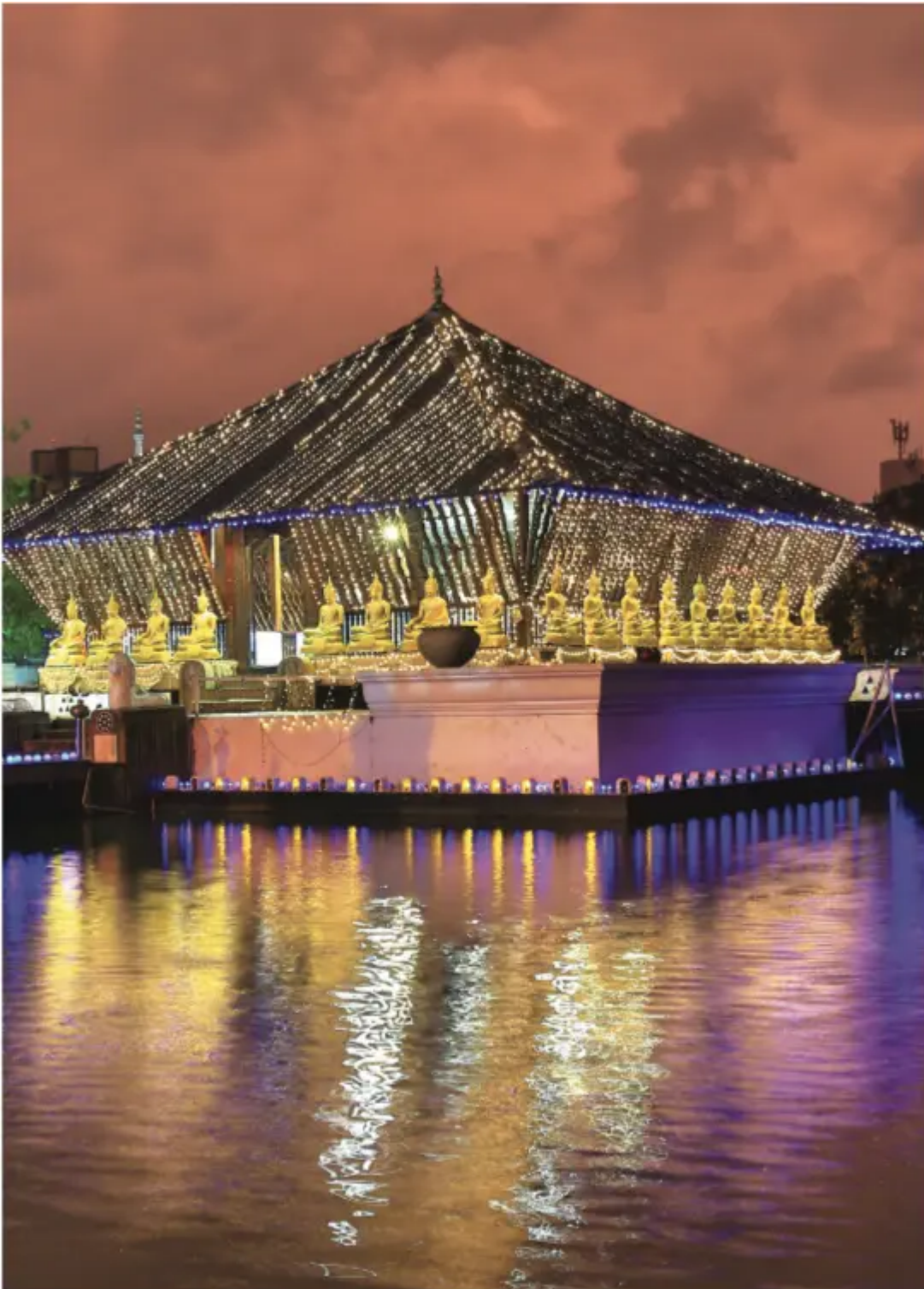
The iconic Seemamalakaya magical upon the Beira Lake. The iconic Seemamalakaya magical upon the Beira Lake.