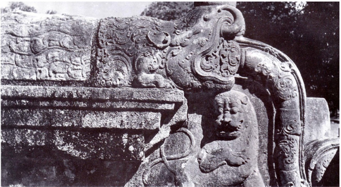
Details of an ornamental balustrade at Polonnaruwa.