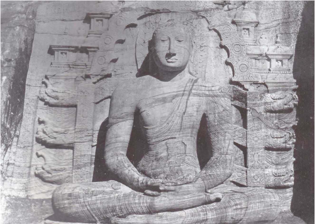
Statue of the sedent Buddha at the Gal Vihara complex