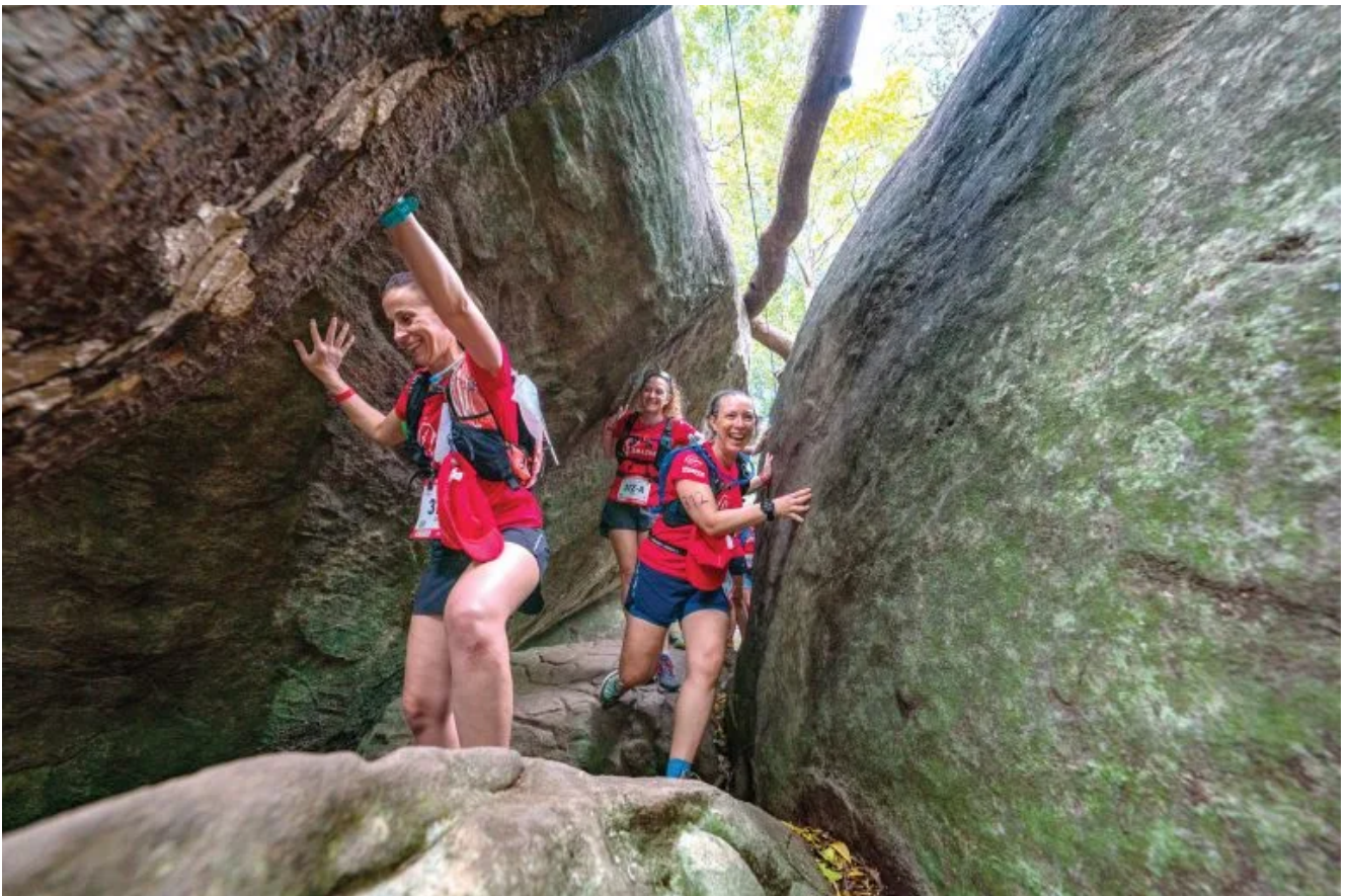
Participants taking part in activities.