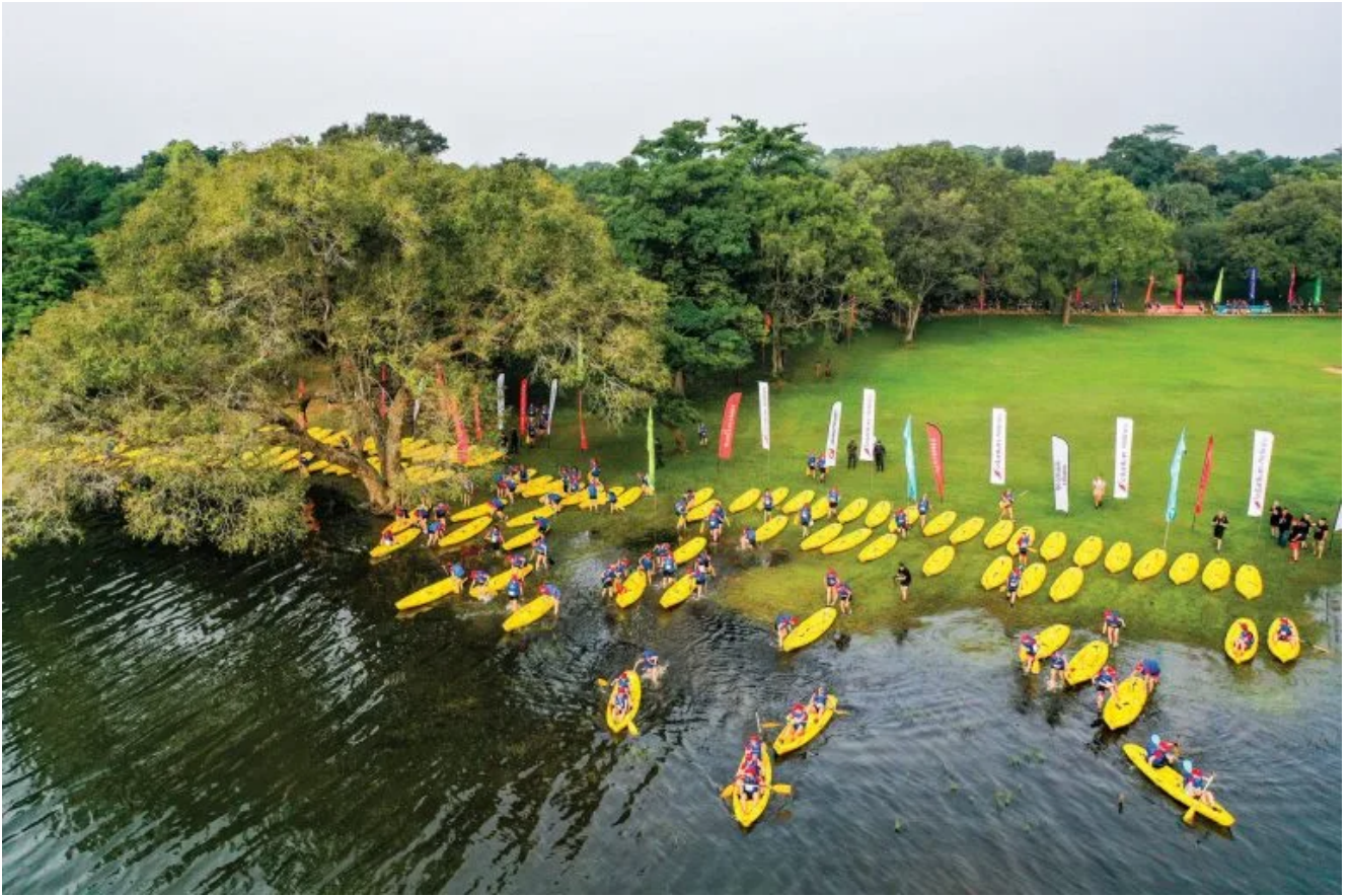
Most picturous moments of participants canoeing.