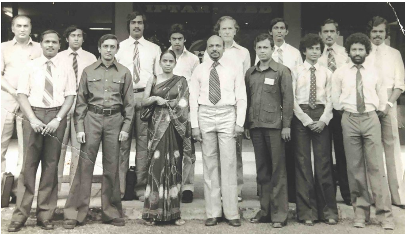
The first group of staff to be trained at RTM, Malaysia in 1981.