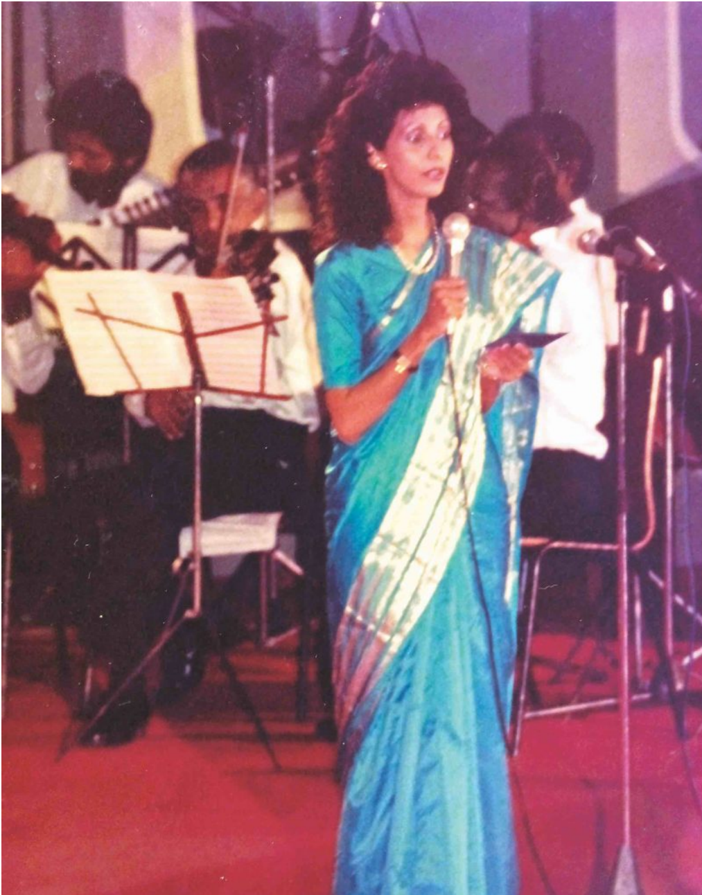
Compering Sawasangeetha 4 th anniversary in 1985.