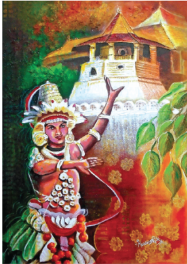
Dazzling Kandyan dancer