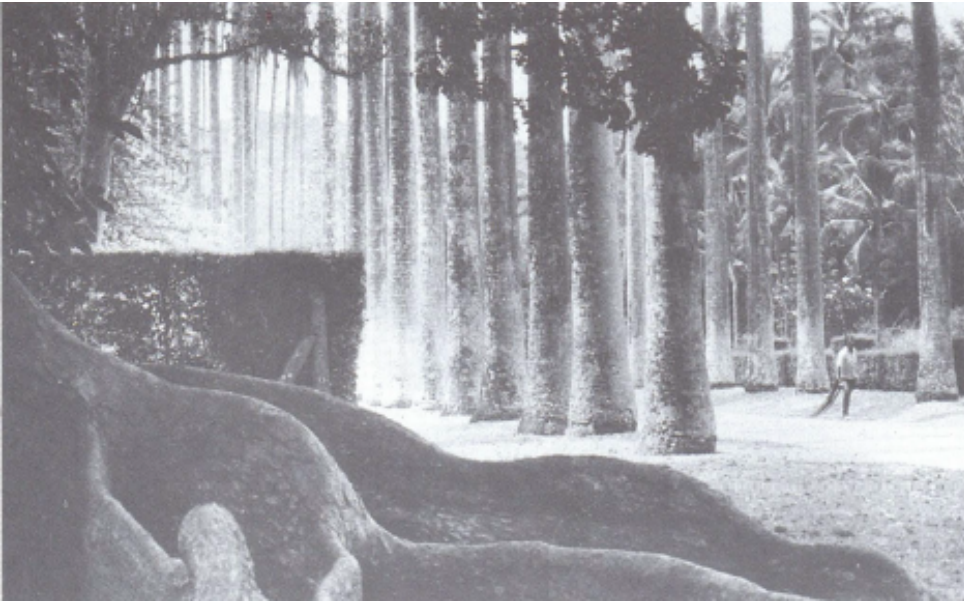
An avenue of trees flanked by palm trees.