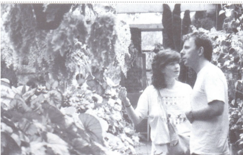
Visitors to the Gardens admire the begonias inside a greenhouse.