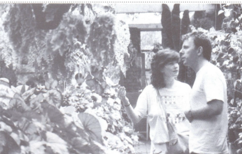
Visitors to the Gardens admire the begonias inside a greenhouse.